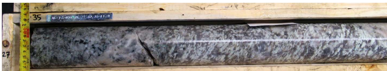
Figure 2: Hole 17-35 from 35 metres