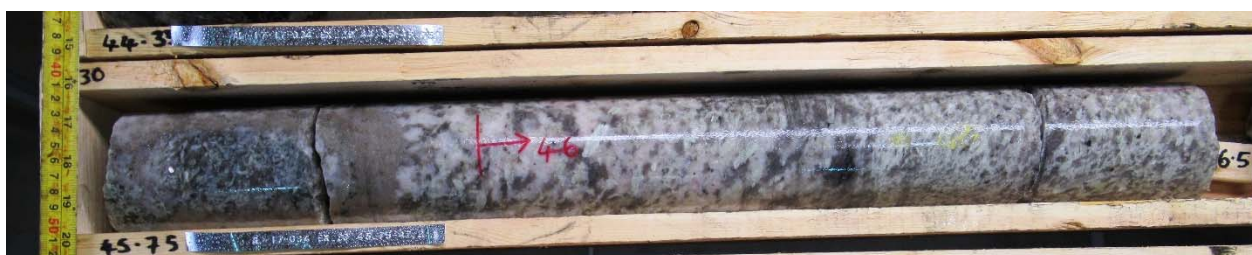
Figure 3: Hole 17-34 from 45 metres