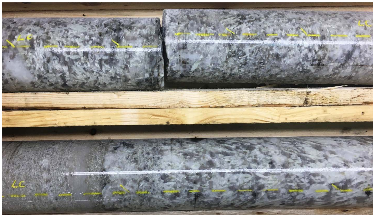
Figure 1: Hole 17-36 from 75 metres