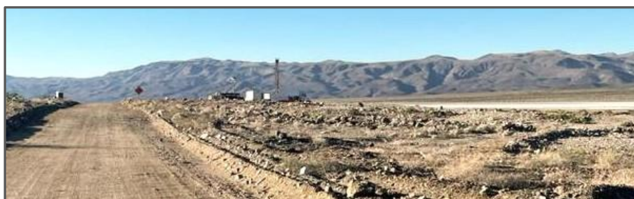
Figure 4: The first drill site - Salt Fire Flat at Liberty Lithium