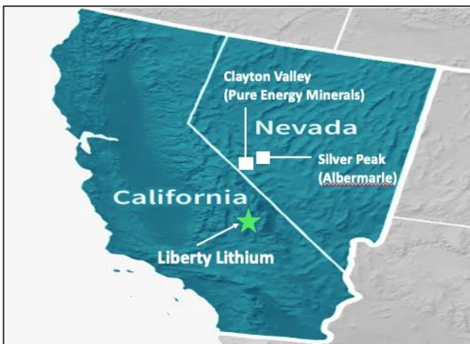
Figure 6: Location map of Liberty Lithium area (SaltFire Flat Project)

Authorised by the Board of QX Resources Limited.