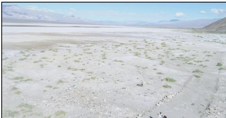
Figure 5: The first drill site prior to rig being onsite - Salt Fire Flat at Liberty Lithium