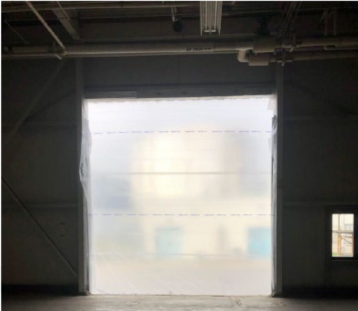
Figure 3: Opening made for De-humidifiers to be bought into the factory