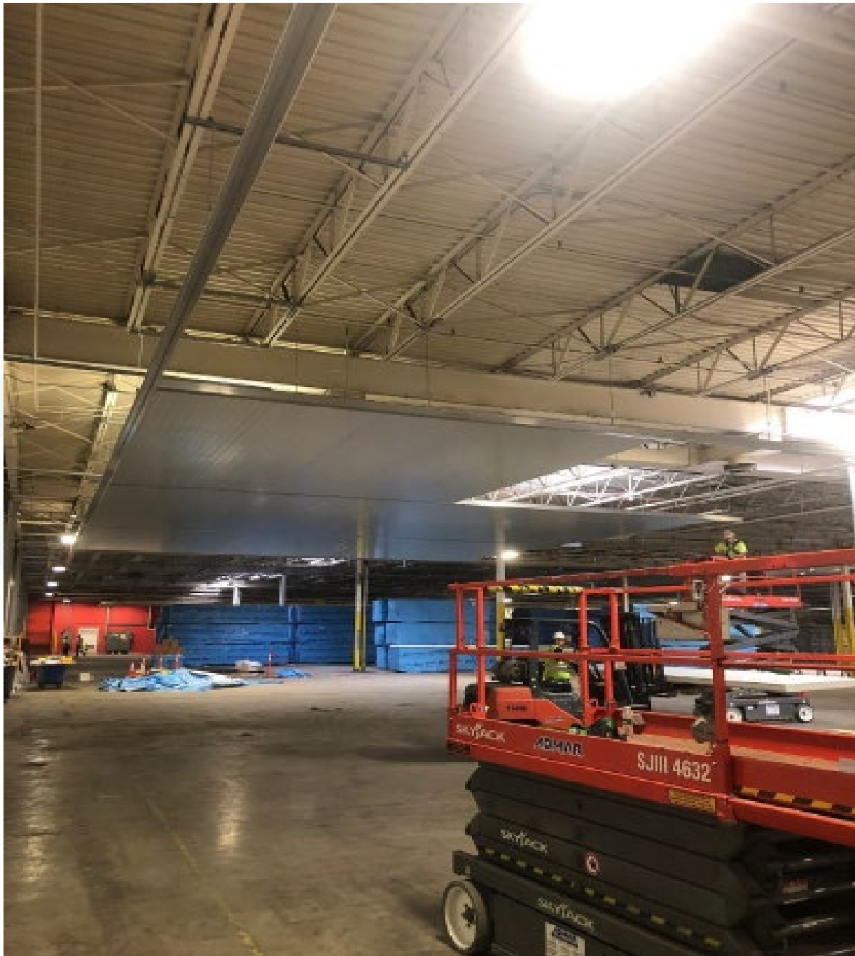
Figure 2: Dry Room Ceiling Plenum being installed