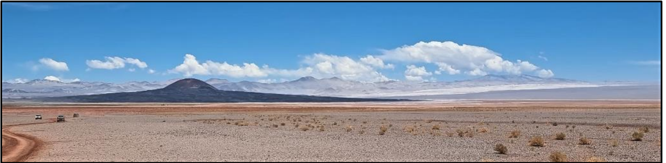
Figure 3. Image of Lake's Kachi Project, looking south, with drilling area to right of image.