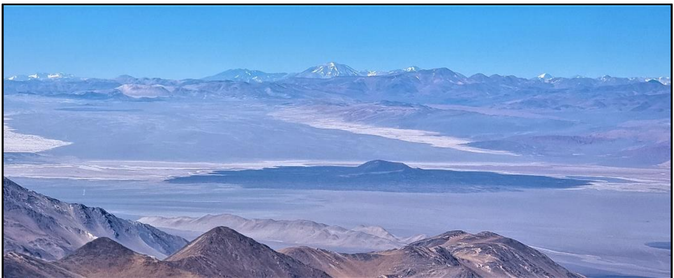
Figure 2. Image of Lake's Kachi Project, covering 30km left to right.