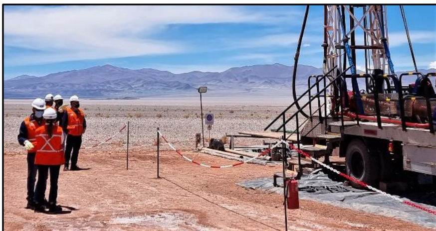
Figure 5. Water well rig at Kachi Project, assessing process water options.