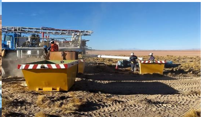
Figure 1 a,b,c: Lake’s Cauchari Lithium Project – View looking north west across the Cauchari salt lake towards adjoining Ganfeng Lithium / Lithium Americas resource and Orocobre / Advantage Lithium resource. Rotary drill rig looking east and setup at Hole #3. (Third Party Resource details summarised in LKE’s ASX announcement dated 6 Sept 2018)