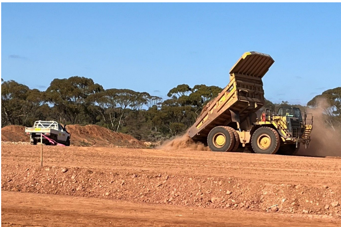
Figure 3: First ore on the Boorara ROM Pad