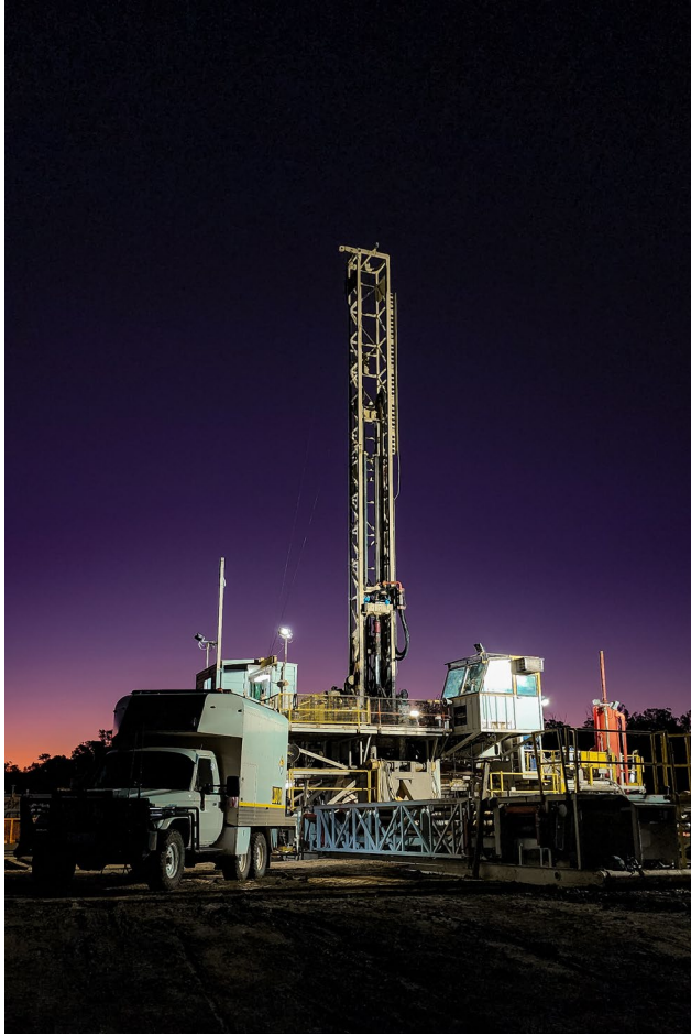
Picture 1: Night view during logging operations.

Establishing a maiden 2P reserve in conjunction with production testing of Rougemont 5 and 6 remains the Company's immediate objective."