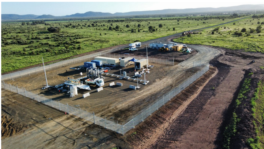
Figure 1: Near completed CNG Facility (15 January 2024)

The work undertaken to weather-proof the access road and CNG facility pad have proven worthwhile with the site remaining in good condition despite continuous rain over the last few weeks. The Company is confident that mechanical completion and plant commissioning can proceed even if wet weather persists. It also means that post commissioning, State Gas will be able to maintain continuous truck access to the facility, which will be critical for continuity of our future gas supply commitments.