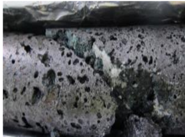
Image: Calcite formed in basalt from CO 2 -charged water-rock interaction at Carbfix sequestration site in Hellisheiði, Iceland.

Basaltic ignimbrites such as those in the Buckland Basaltic Sequence within and adjacent to ATP 2062 are considered to have the greatest potential for the sequestration of carbon by this process. Basalt rocks are highly reactive and contain the elements needed for permanently immobilising carbon dioxide through the formation of carbonate minerals. When in the form of non-welded ignimbrites, the basalt is likely to be very permeable and porous, containing storage space for the mineralised carbon.