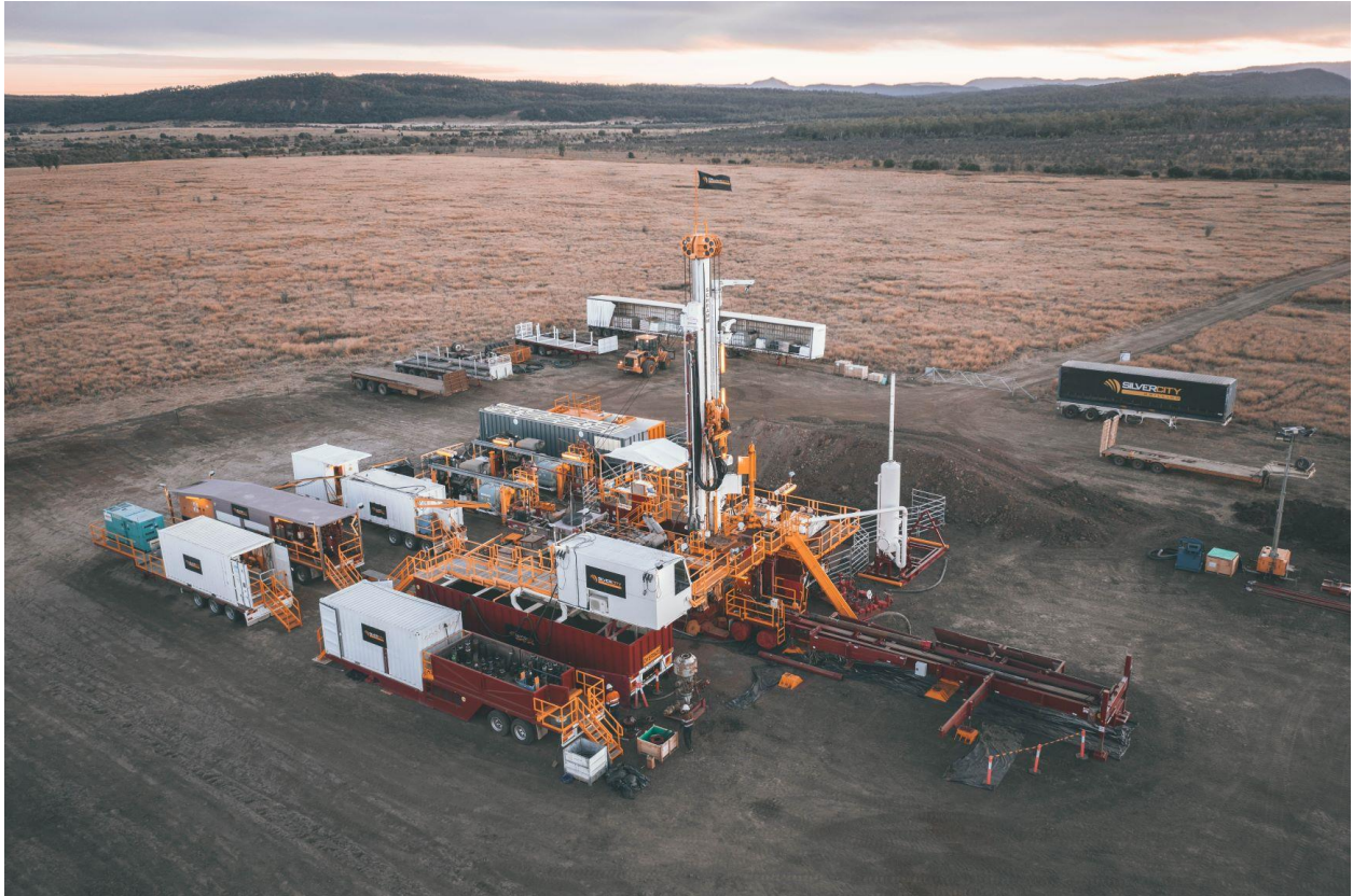
Drilling at Rougemont-1 May 2021

State Gas is implementing its strategic plan to bring gas to market from Reid's Dome and Rolleston-West to meet near term forecast shortfalls in the east coast domestic gas market. The strategy involves progressing a phased appraisal program in parallel with permitting for an export pipeline and development facilities to facilitate the fastest possible delivery of gas to market 5 . During 2020 and 2021, State Gas' has focused its efforts on confirming the producibility of the gas through production testing of the wells.