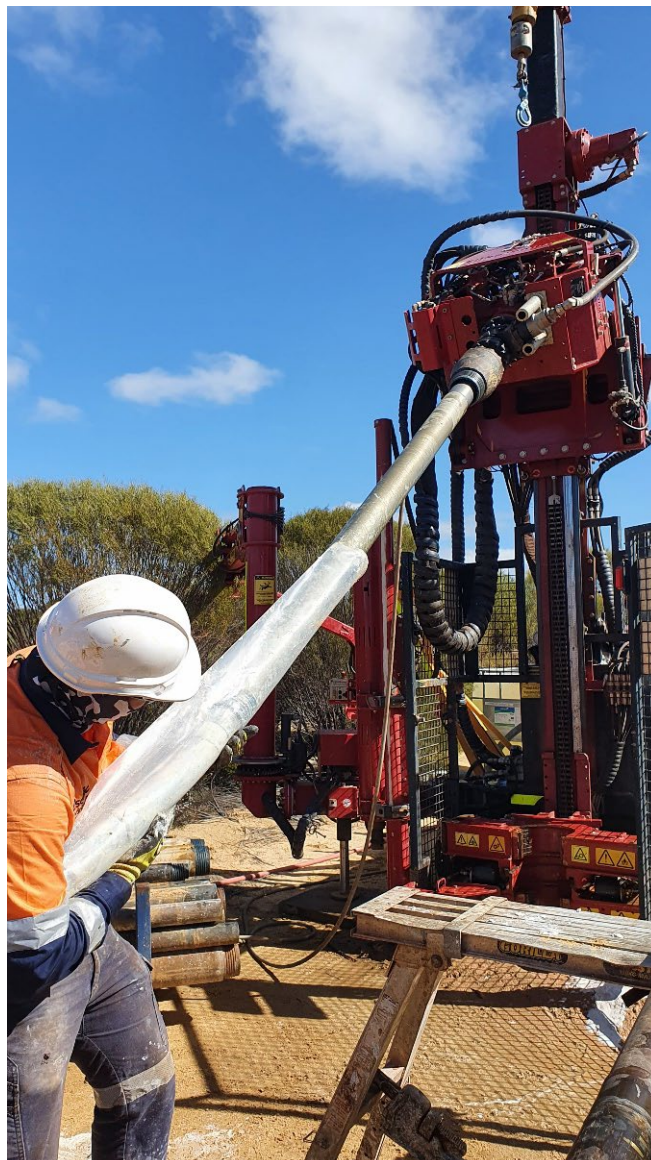
Figure 1: Drilling bright white kaolin at Tampu Kaolin Project, Beacon WA

Corella Resources Ltd ( ASX:CR9 ) (" Corella " or the " Company ") is pleased to advise that resource definition drilling has commenced at the Company's 100% owned flagship Tampu kaolin project, located near Beacon in Western Australia. The drill program will total ~1,000m and consist of 50 to 80 sonic drill core holes, to an average depth of ~15m to a drill spacing of 80 x 80m in select locations (see Figure 2).