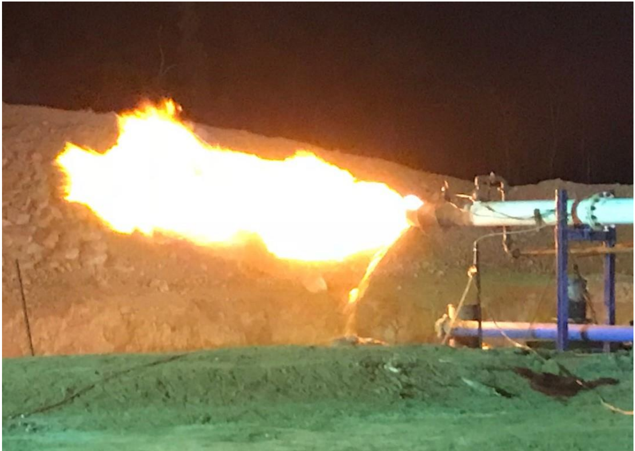
Figure 1 - Albany 1 flow test across a 13 metre interval in the Lake Galilee Sandstone Reservoir

Figure 1 below is a photograph of the 10" diameter flow line and gas flaring from the flowtest. A short one-and-a-half-minute video of the flow test can be viewed at http://cometridge.com.au/Video/Albany1_Flare.mp4