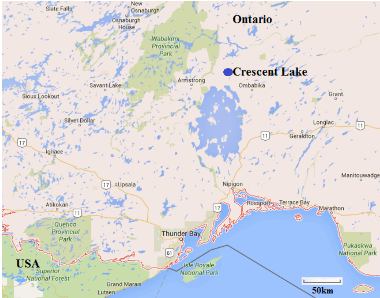
Figure 2: Regional Location, Crescent Lake is situated in the northeast portion of the Sovereign Claims above the four lithium-bearing pegmatite deposits (See Figure 1).

The Jackfish forestry road system provides access to the property and the port of Thunder Bay is a major facility that transports grain, coal, liquids and general cargo via the Great Lakes to the Atlantic Ocean.