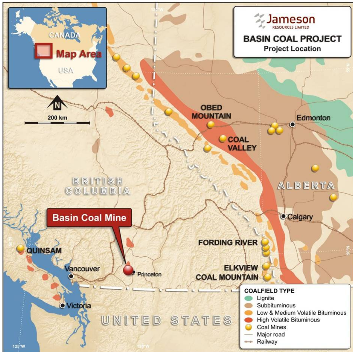
Figure 1 - Location Diagram – Basin Thermal Coal Project