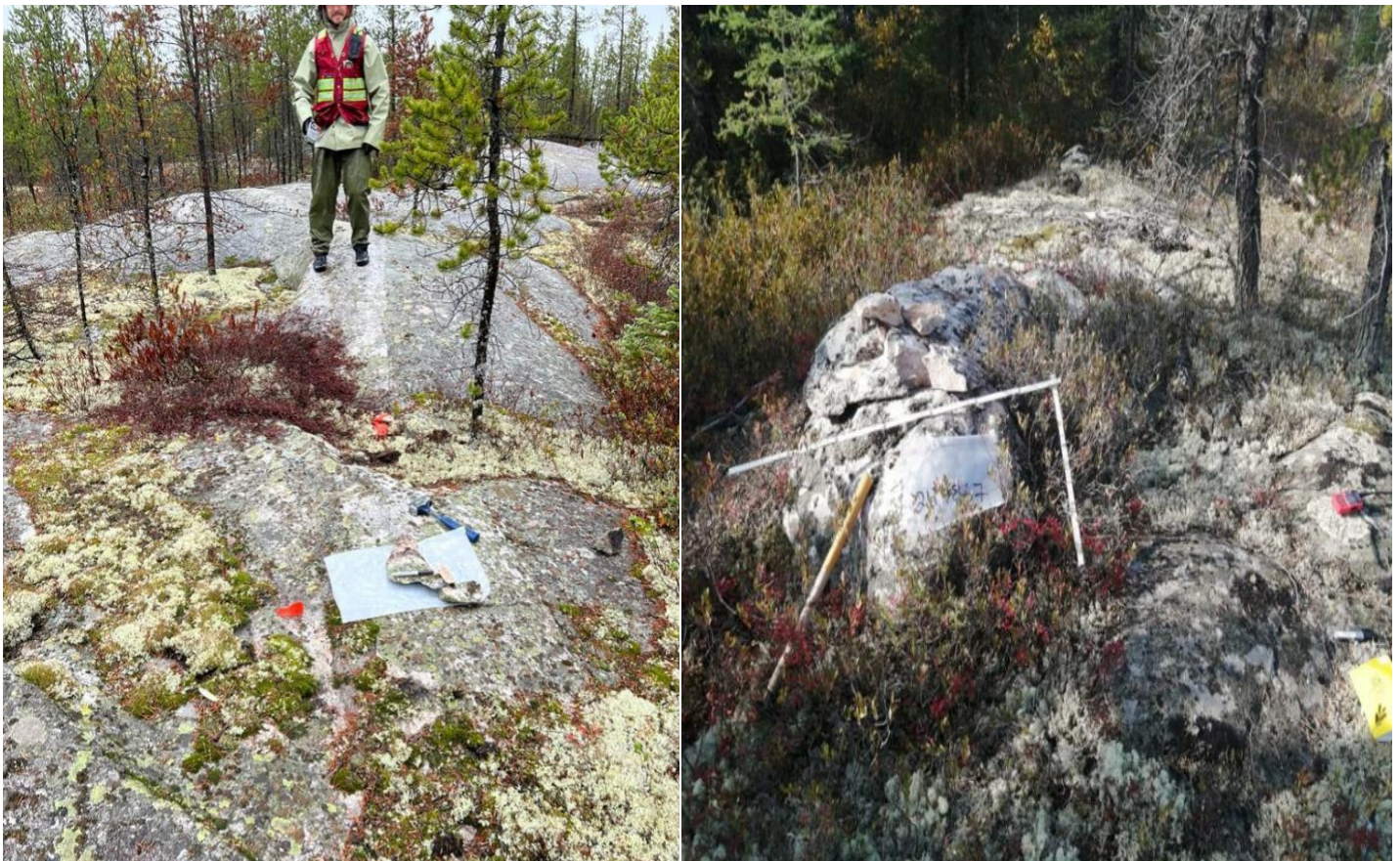
Figure 1 – CDC geologists collecting pegmatite samples

In addition to the presence of pegmatites, CDC also identified several copper-gold targets featuring sulphide-bearing laminated quartz veins within significantly altered (basalt-ultramafic) host rock. Notably, some of these newly identified quartz veins are located near historical drilling. As a result, twelve (12) rock chip samples were collected from these zones and submitted for analysis.