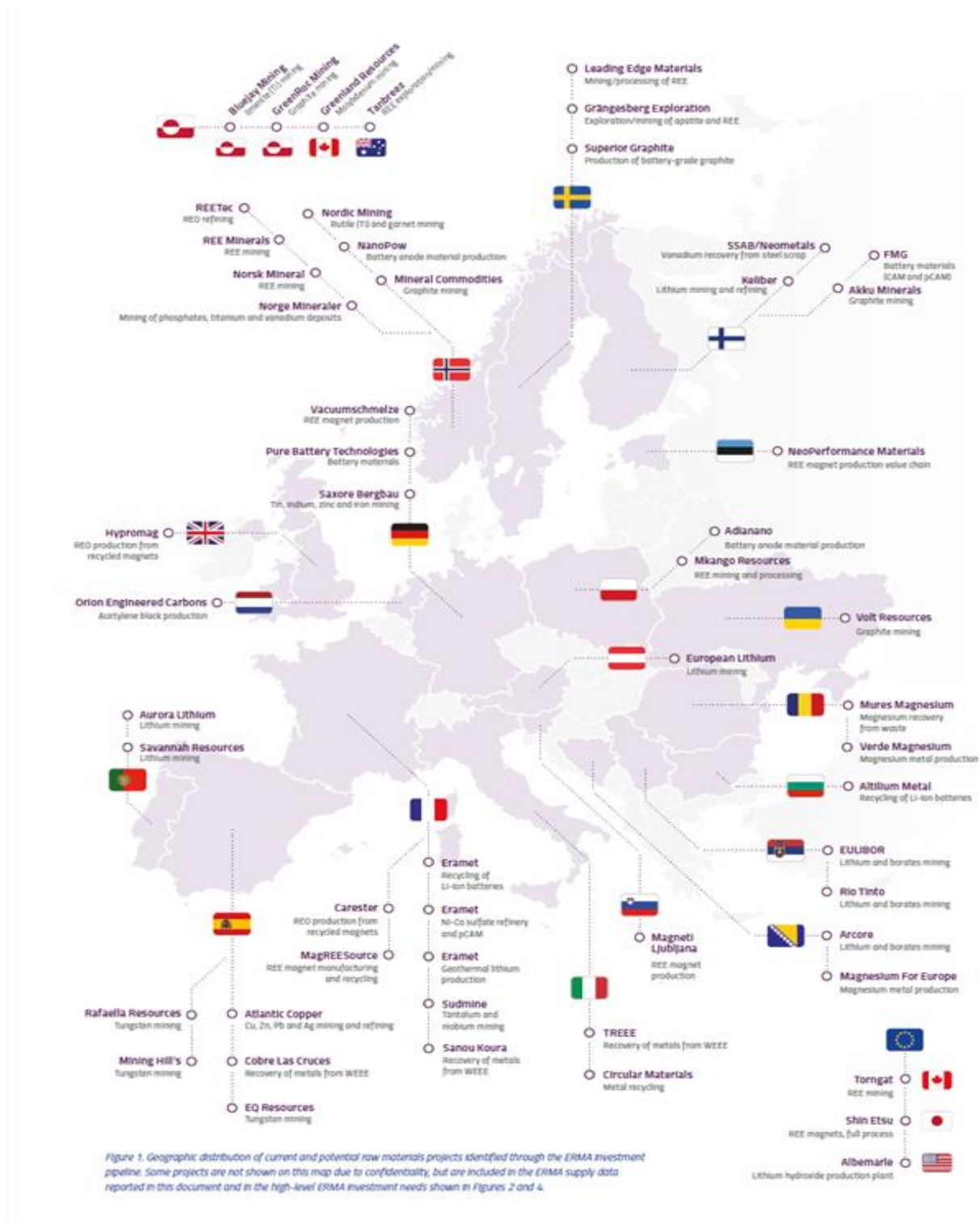
Figure 1: Raw Materials Projects Identified in ERMA Investment Pipeline.

makes Europe an attractive market opportunity for Volt”.