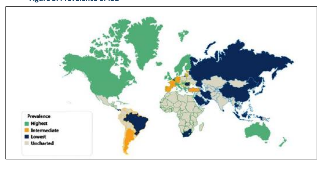
Figure 3: Prevalence of IBD

More than 5 million people suffer from IBD worldwide ^{25} . We estimate that there are ~2.5 million patients in the EU and 1–1.3 million in the US ^{26} . In the US, roughly 40% of these people suffer from Crohn's disease and the remaining 60% have ulcerative colitis. Moreover, IBD has also emerged in newly industrialized countries in Asia, South America, and the Middle East, and is fast evolving into a global disease. Scientists project that the prevalence of IBD is expected to rise exponentially by 2025 due to cumulative addition of incident cases in a chronic disease that has a young age of onset and low mortality (Figure 3).