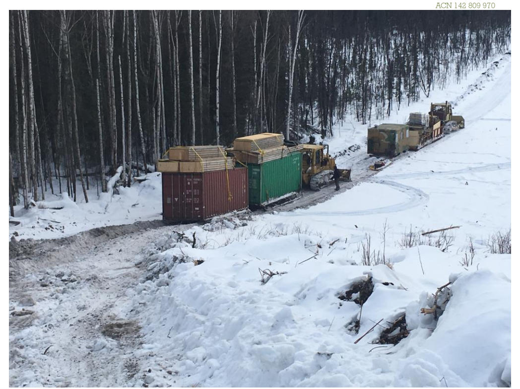
Figure 3: Mobilisation of the diamond drill rig and camp accommodation, following a man-made fire break through the forested section of the Fort Greely Training grounds.