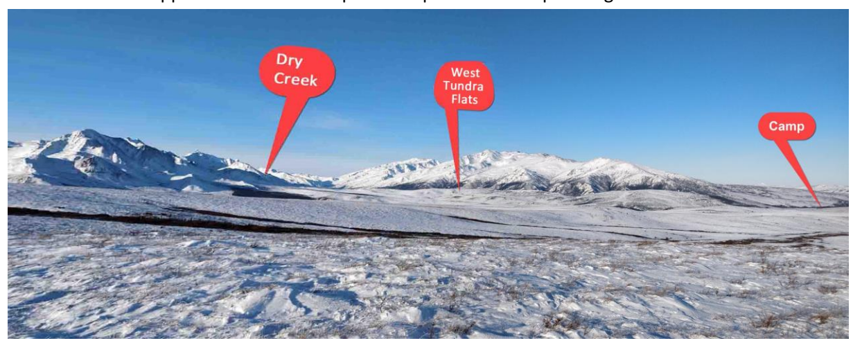
Figure 1: Route looking west towards Red Mountain and the camp site.

Overland mobilisation of the major items necessary for the planned exploration program was undertaken with equipment delivered to the camp site in early April. Equipment including the diamond drill rig and camp accommodation, along with support infrastructure, were mobilised to the camp site alongside the airstrip at Newman Creek, located just to the east of White Rock's tenements (See Figures 1, 2 & 3). This infrastructure will support White Rock's exploration plans for the upcoming field season.