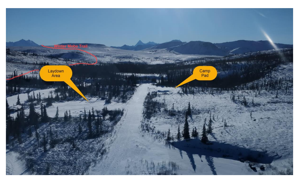
Figure 2: Newman Creek airstrip and camp location (with the Red Mountain Project to the west (right)).