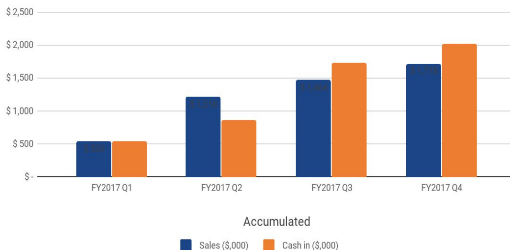
Sales ($,000) and Cash in ($,000)

Pleasingly, the company continues to experience strong consumer interest in the Mute and Turbine technology with sell through increasing in July as a result of promotional activities that took place late in the quarter.