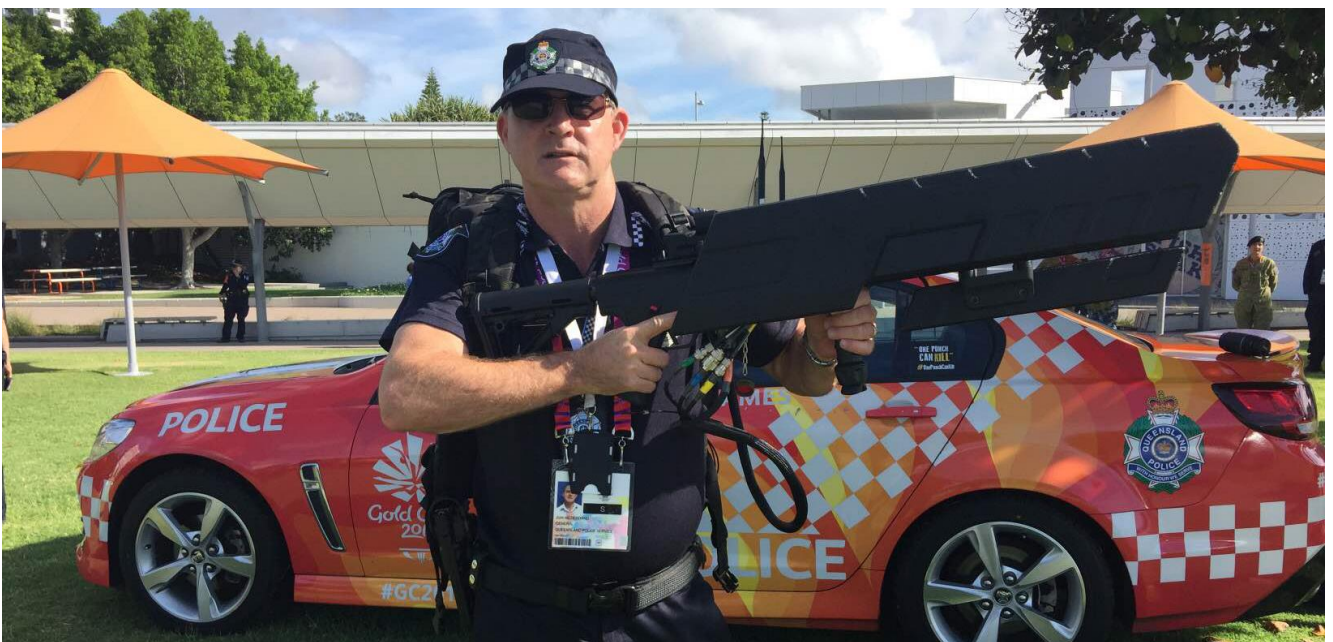
Image: Queensland Police Deploying DroneGun MKII