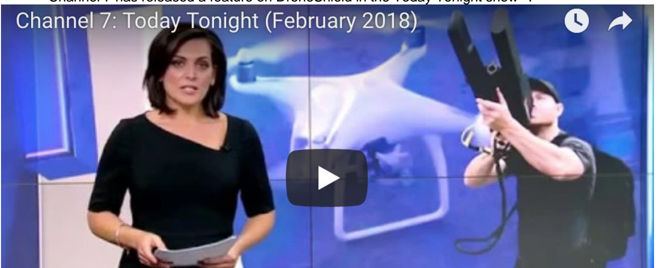
Image: DroneShield on Chanel 7 Today Tonight show

Channel 7: Today Tonight (February 2018)