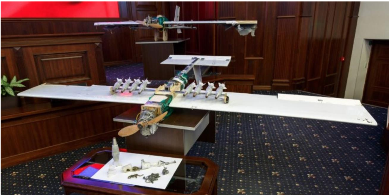
Image: two of the drones which bombed the Russian military camp in Syria, on display at the Ministry of Defence of Russian Federation