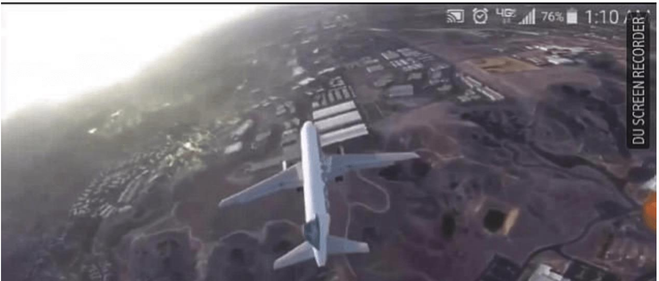
Image: Drone divebombing an airplane in Las Vegas