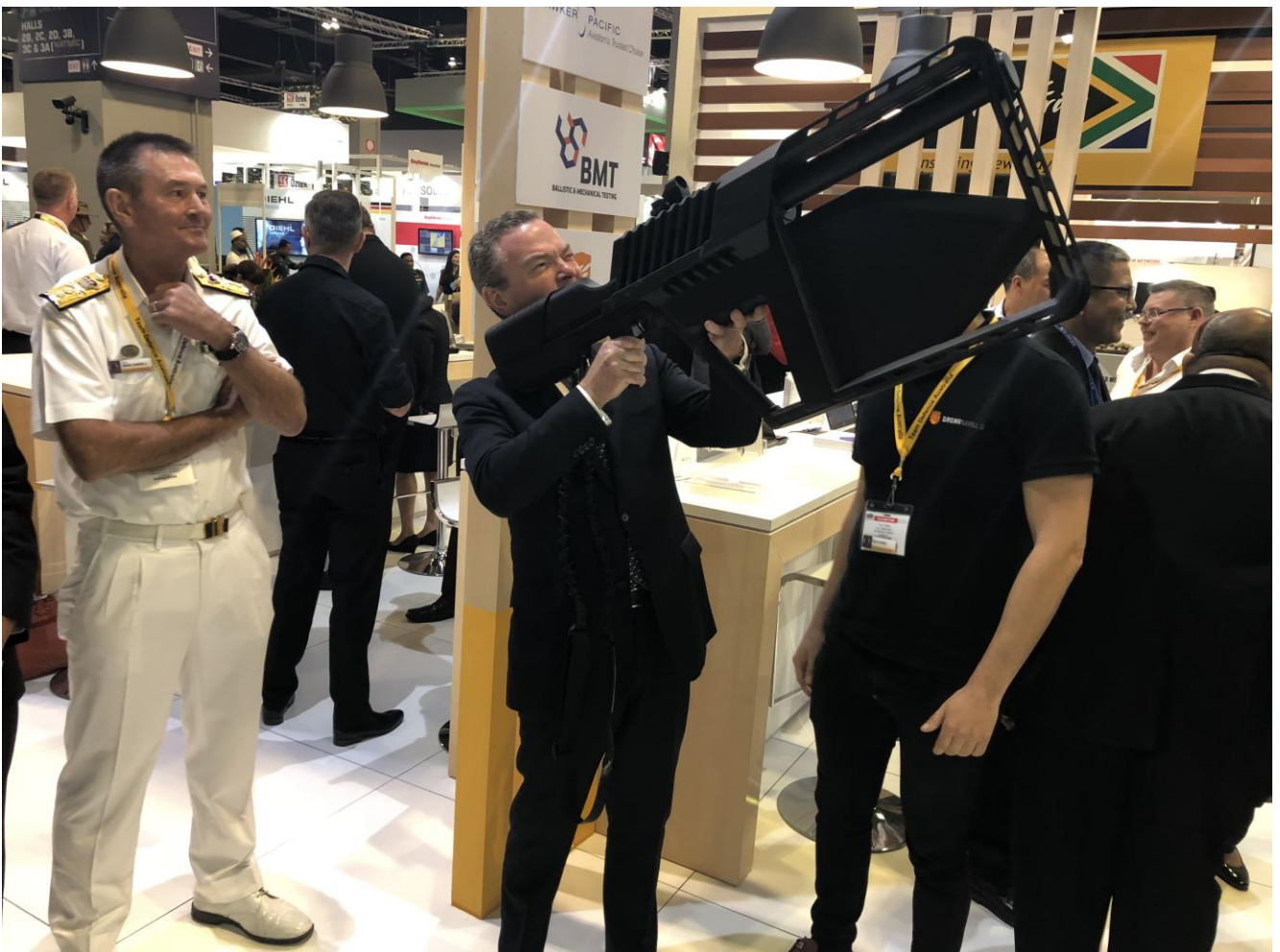
Image: Hon Christopher Pyne, Australian Minister for Defence Industry, reviewing DroneGun Tactical