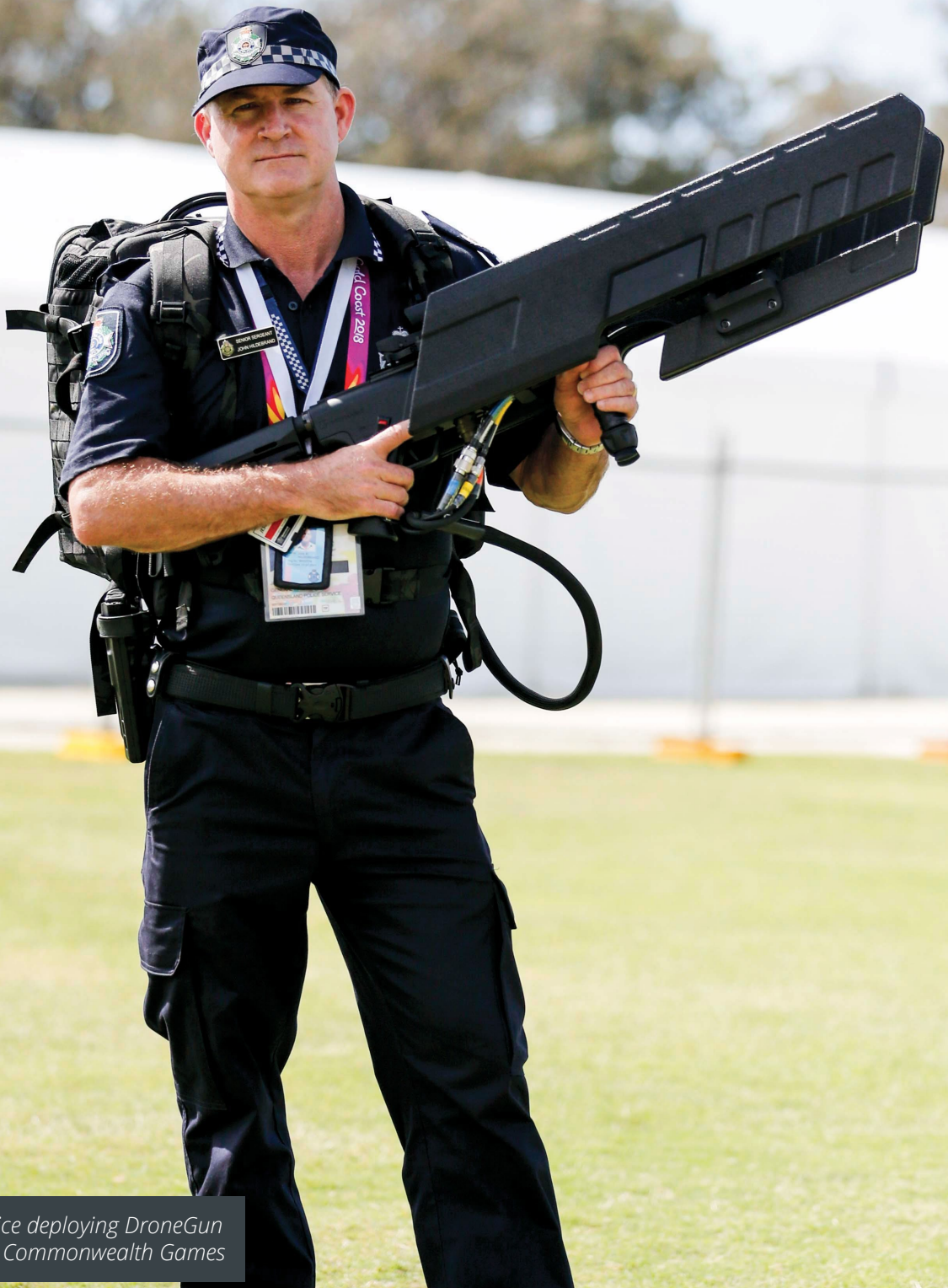
Image: Queensland Police deploying DroneGun at the Gold Coast 2018 Commonwealth Games