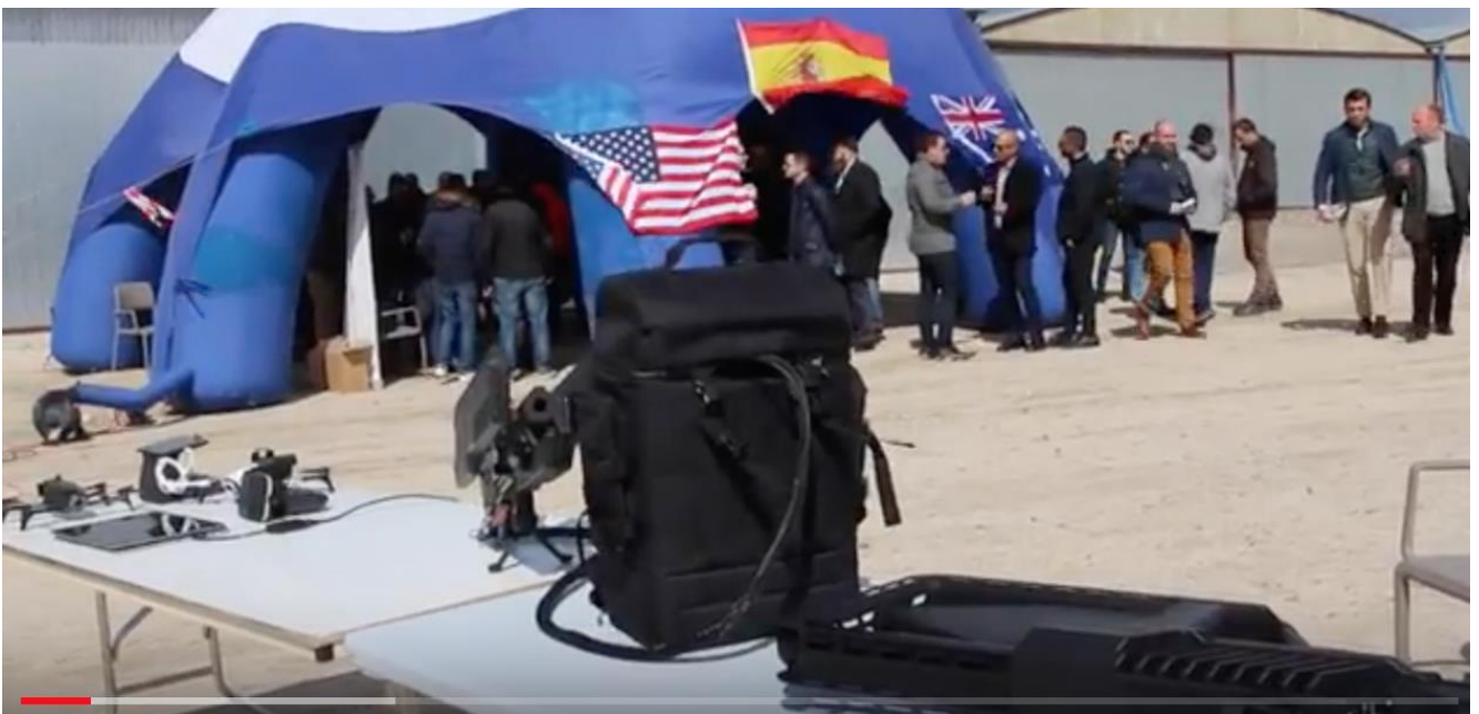
Image: Infodron coverage of the DroneShield Madrid demo in March 2018