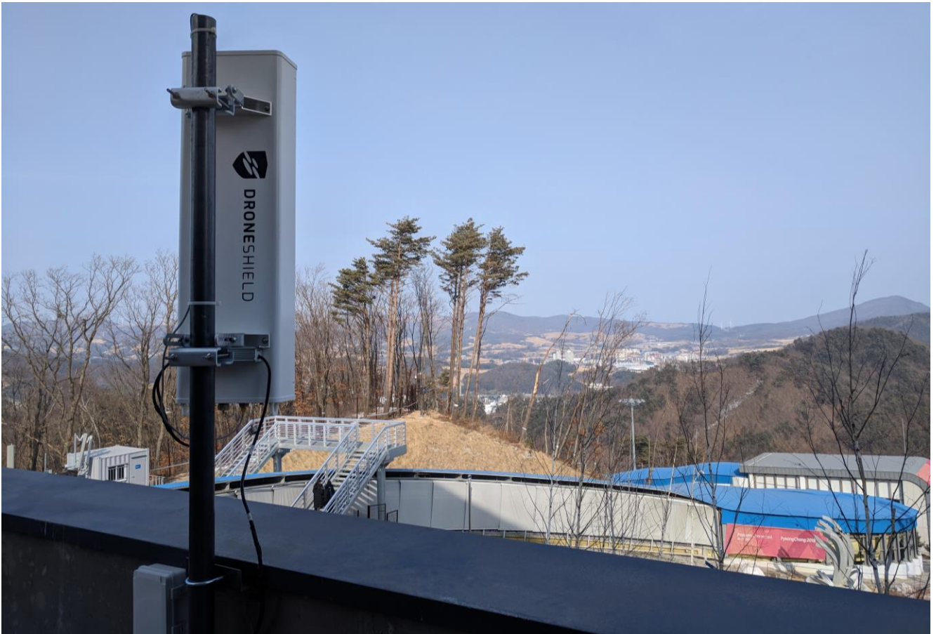
Image: DroneShield's RFOne overlooking an Olympic venue at 2018 Olympic Winter Games