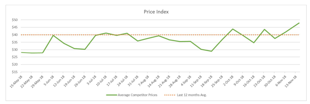
Graph 1: Price Index – May 2018 to November 2018

As expected at this time of the year, the Price Index is starting to show higher competitor prices following a phase of below average prices during the majority of the September 2018 Quarter. Accordingly, DriveMyCar is now experiencing increased demand for its competitively priced vehicles demonstrated by Net Rental Days Booked for the first 30 days of October 2018 being 31% higher than the full 31 days of October 2017 and having already reached 56% of the Net Rental Days Booked for the full 92 days of the September 2018 Quarter.