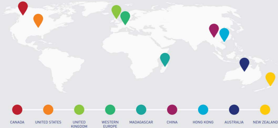
MODERN DENTAL GROUP LOCATIONS