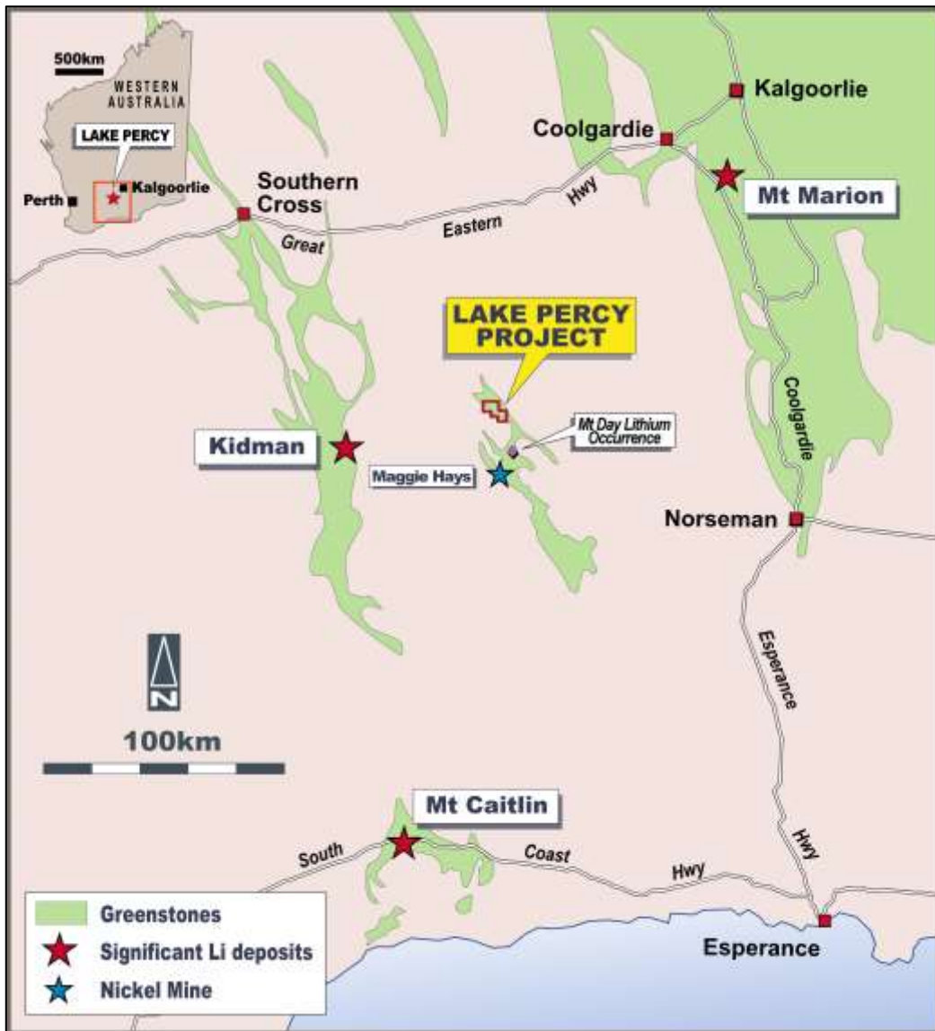
Figure 2: Lake Percy Project – Location Plan and Regional Geology