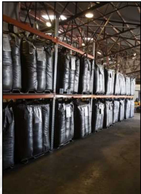
Processed Graphite (2015)

The benchmark pricing under the sales contract exceeds Valence Industries' previously announced weighted average price of US$1,335 per tonne and includes take or pay provisions on the volumes ordered.