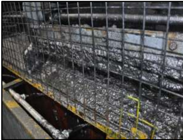
Valence Graphite Flotation

Since mid-June 2015, the plant has been subject to stoppages for ongoing process enhancement and calibration.