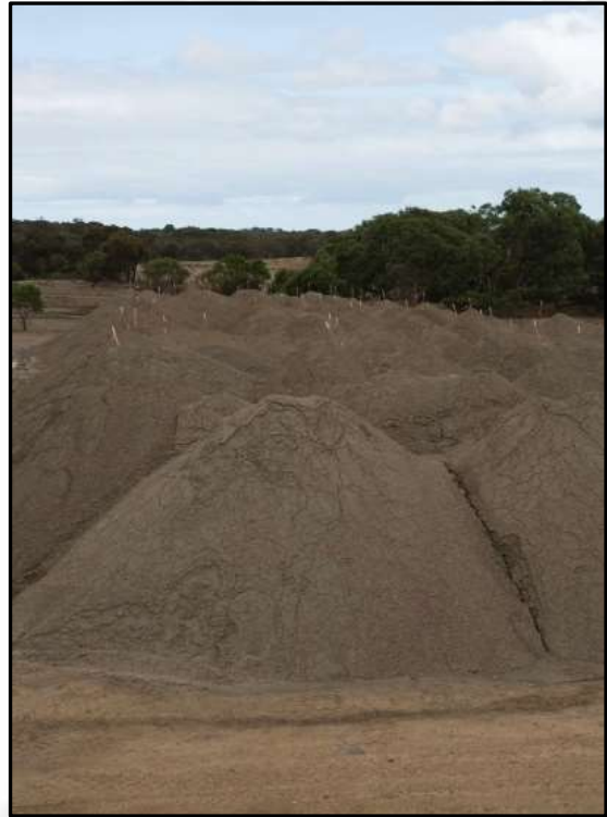
Run of Mine Feed Stockpiles

The process water ponds are in use for current production and the upgraded tailings storage facilities are being integrated into that process. Each of these elements form a key part of the move to increase the production feed rate to 20t per hour. The construction and operation of the tailings storage facilities will form an ongoing aspect of the operations with further construction stages planned to coincide with increasing mining and production operations.