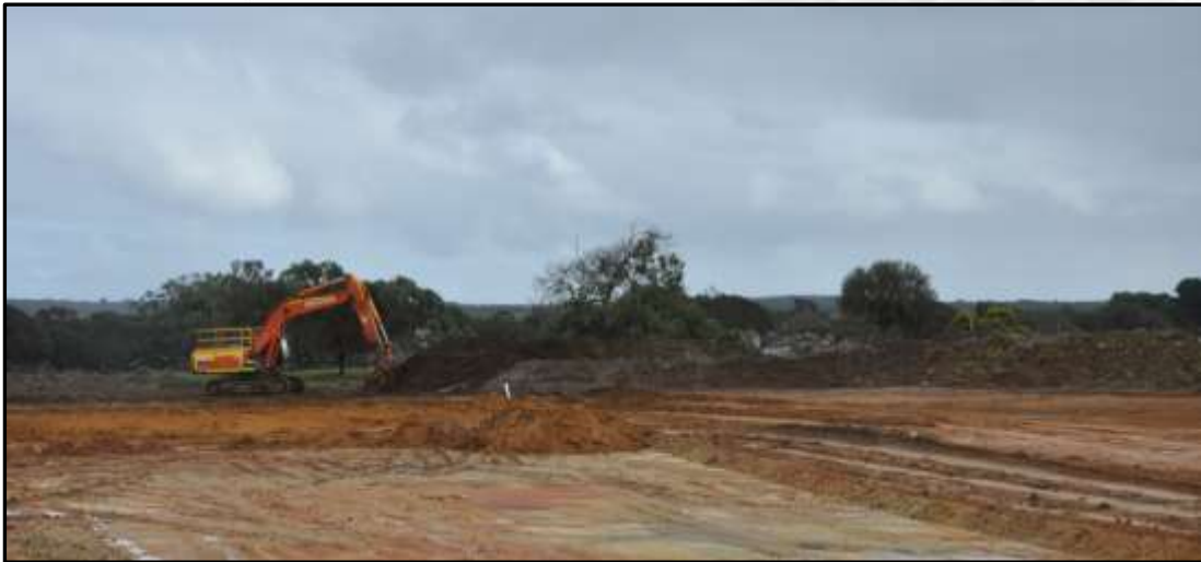
Uley Pit 2 – Mining Overburden Removal (2015)

The material removed from Uley Pit 2 has been used to construct the tailings storage facilities (TSF) during the quarter.