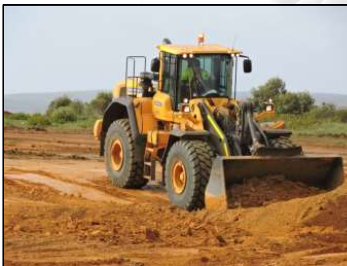
Uley Pit 2 – Mining Overburden Removal (2015)

carbon. The upgrade was based on approximately one third of the results of the drilling program on the Uley Pit 2 Extension.