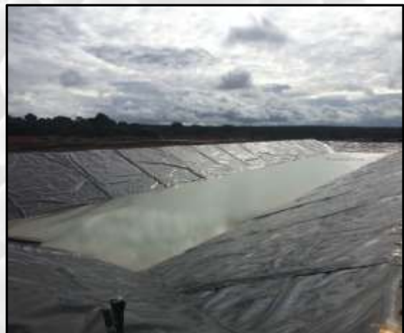
Process Water Return Ponds