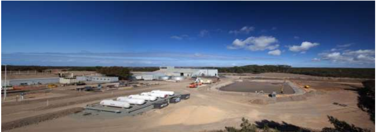
Valence Industries – Uley Graphite™ Phase I Plant Operations (2015)

Valence Industries is Australia's only graphite company. Valence Industries will mine, process and sell flake graphite products from its Uley Graphite™ facilities near Port Lincoln, South Australia for supply to global customers with an expansion program and focus on advanced high-margin product development.