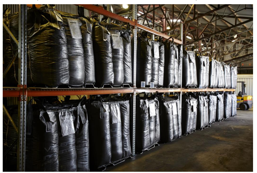
Uley Graphite™ Production Dispatch Area

biomedical applications for volumes equal to the first 12 months of production. Due to confidentiality and commercial requirements, Valence Industries is not able to disclose specific customer details.