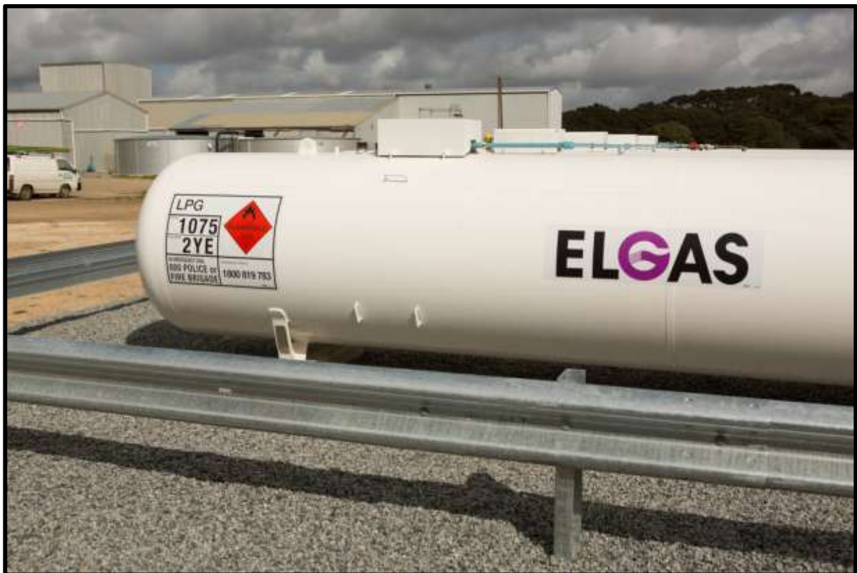
Valence Industries Gas Farm Installation – September 2014

An important component of the Secondary Processing Circuit has been the installation of a new gas farm. This has allowed Valence to successfully test the upgraded graphite drying systems at the Uley Graphite site.