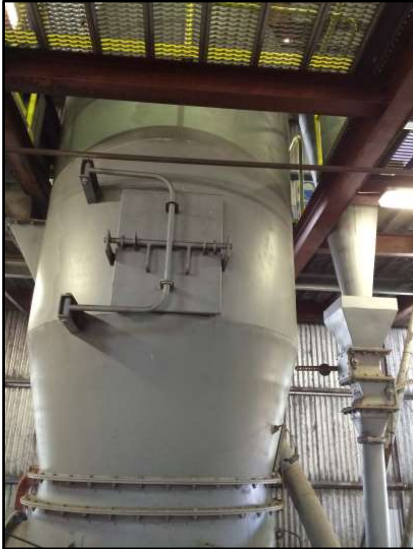
Valence Industries – Upgraded Gas Dryer – September 2014

The use of gas-fired drying facilities is consistent with the company's commitment to deliver environmentally sensitive and sustainable growth. The gas-fired system allows Valence Industries to better manage its greenhouse gas emissions in its graphite manufacturing. The use of gas provides for much lower emissions than other sources such as petrol, diesel or electricity.