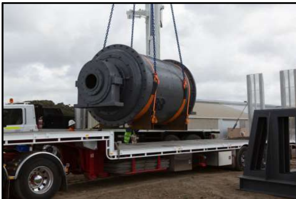
New Mill Arrives at Valence Industries – September 2014

Over the past week Valence Industries received delivery of the new mill that forms part of the primary processing circuit in the Phase I Plant.