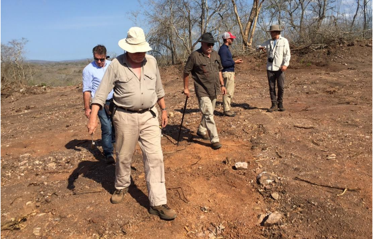
Figure 4 : GK senior management and consultants inspecting Ancuabe site