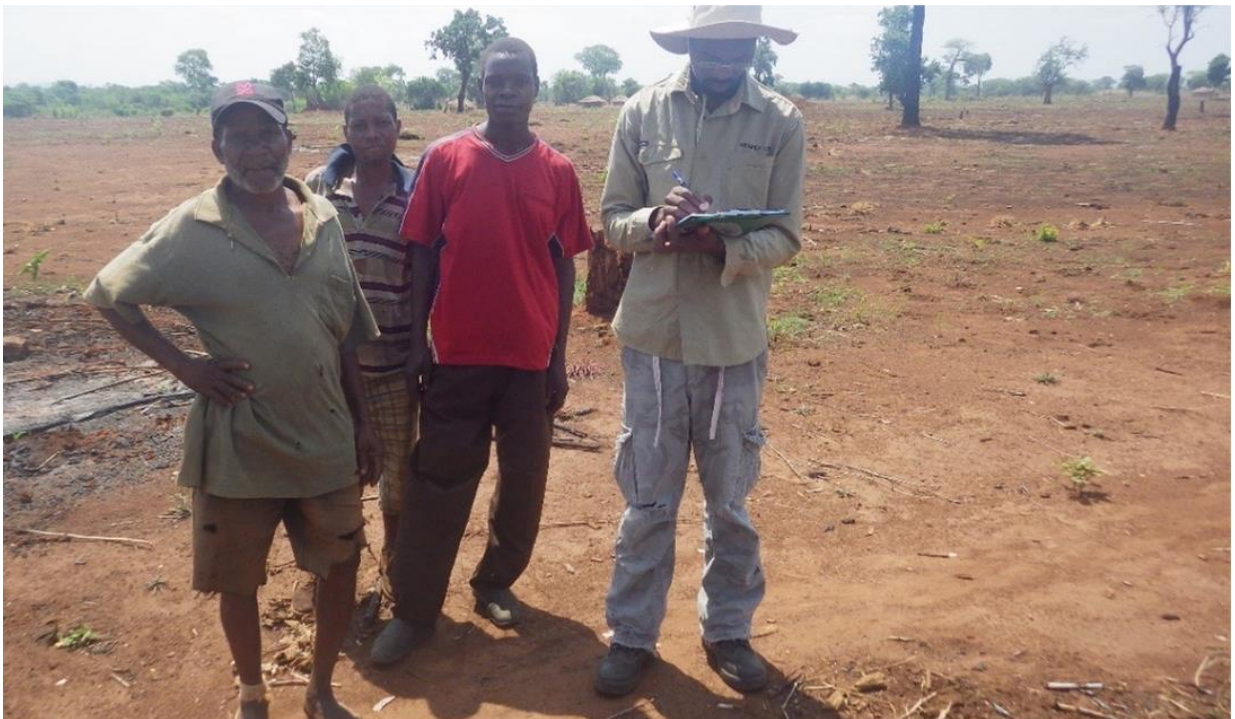
Figure 2 : Land use mapping and consultation with local farmers

The land use application known as the Direito do Uso e Aproveitamento da Terra ( DUAT ) is advancing with ongoing community consultation and land-use mapping program continuing in and around the villages surrounding the proposed operation.