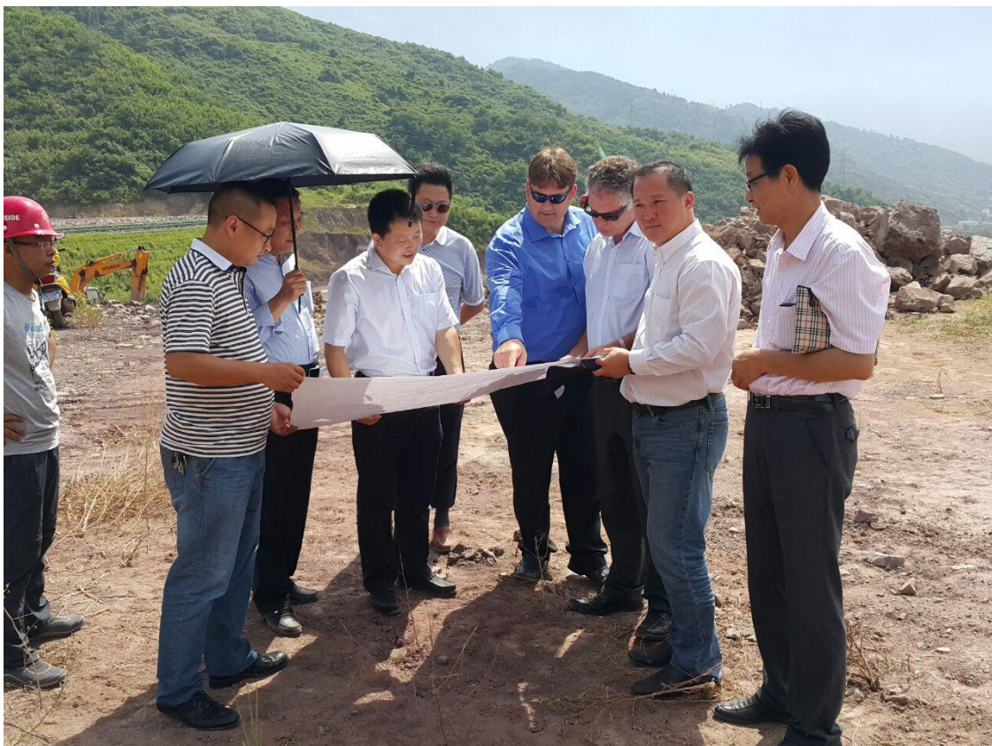
Figure 2. Representatives from the Xingshan Government, YXGC and Triton review the plan of the Xingshan industrial park.

Triton also inspected the accommodation facilities located a short distance from the proposed graphite plant site. These facilities are expected to house approximately 400-500 workers.