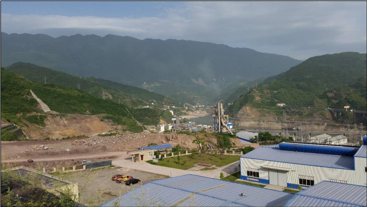
Figure 1. Xingshan proposed graphite plant site. Hydro-electric sub-station (right centre) and port loading facilities (centre).