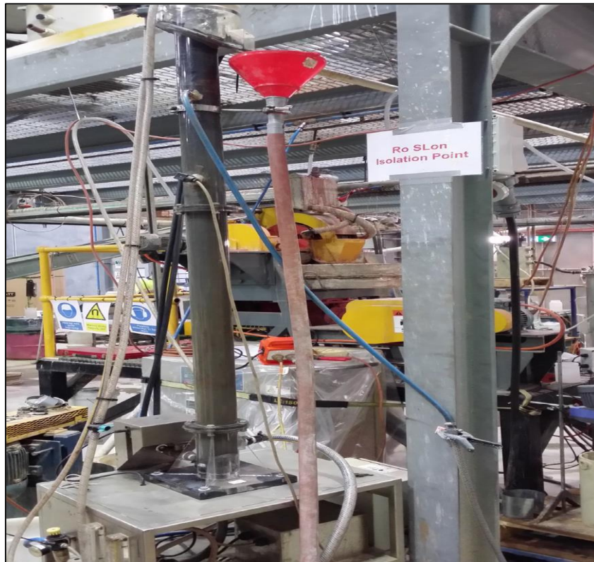
Figure 3. The column float cell test setup at SGS Laboratory, Perth

The Company is assessing alternative flotation methods such as stand-alone column flotation chambers. Should these test be successful the use of column chambers could help to keep down the capital expenditure in the processing plant, as the structural steel requirement for a setup using column cells is significantly less than that for a conventional float chambers. The test will ensure the most cost effective and efficient graphite recovery process is used during the large scale commercial production of the high quality graphite concentrate.