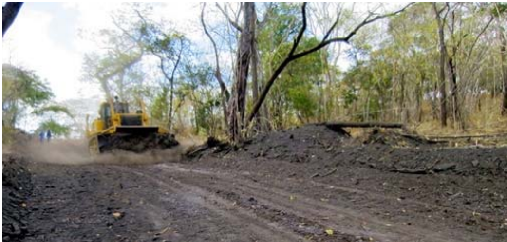
Figure 1. Earthmoving equipment shifting strong graphite mineralisation which is present at surface on access tracks at Nicanda Hill prospect.

Finalising the drilling program by 3 October 2014 was a significant achievement given that heavy earthmoving equipment (Figure 1) to create access tracks to Nicanda Hill and the northern sections of the deposit were only deployed on site in late August.