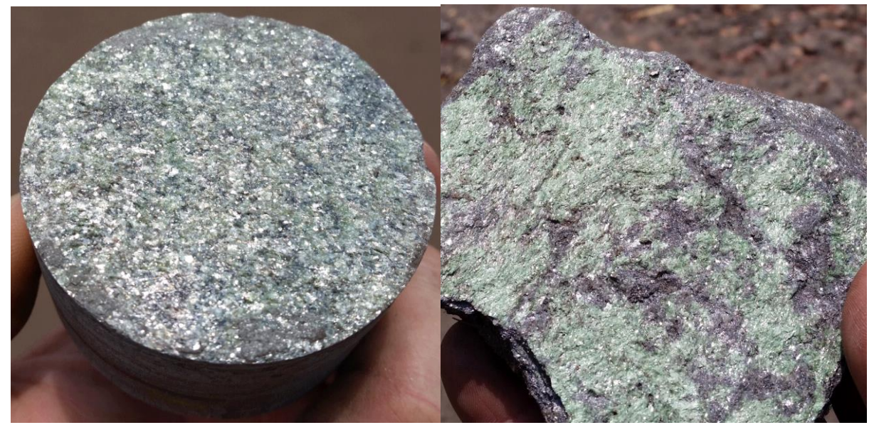
Figure 3. Drill core (left) and rock chip (right) samples from Nicanda Hill prospect on License 5966.

Triton confirms about 45% of RC and Diamond drilling assay results have now been received from the SGS South African laboratory and the Intertek Genalysis laboratory. A full-suite ICP (multi-element) analysis including vanadium on all samples continues in laboratories in both South Africa and Australia.