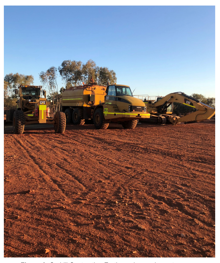
Figure 6: Carhill Contracting Earth moving equipment