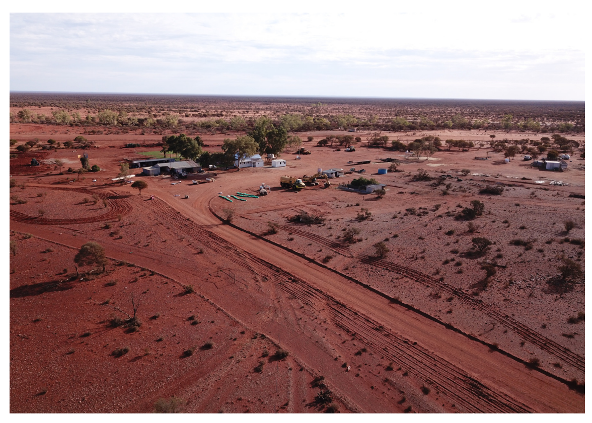
Figure 4: Tarmoola Station (SW view)