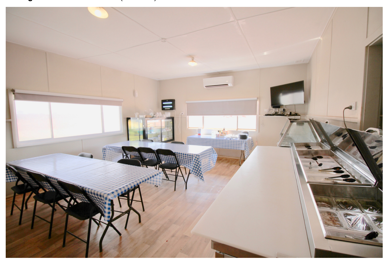
Figure 5: Tarmoola Exploration Camp Mess Hall