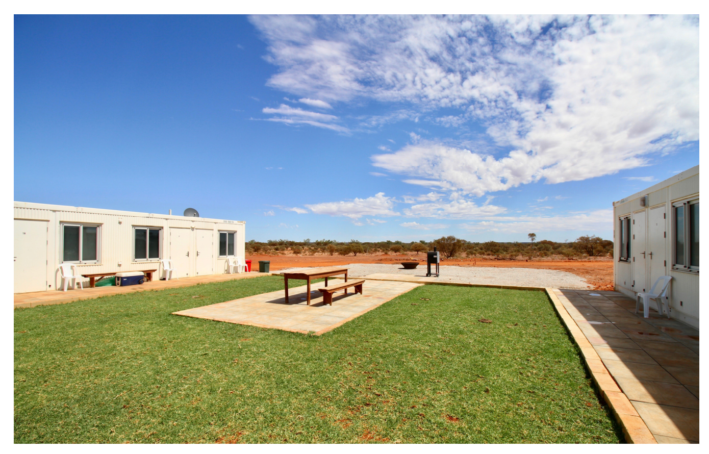
Figure 8: Tarmoola Exploration Camp

This announcement has been authorised for release by the Board.