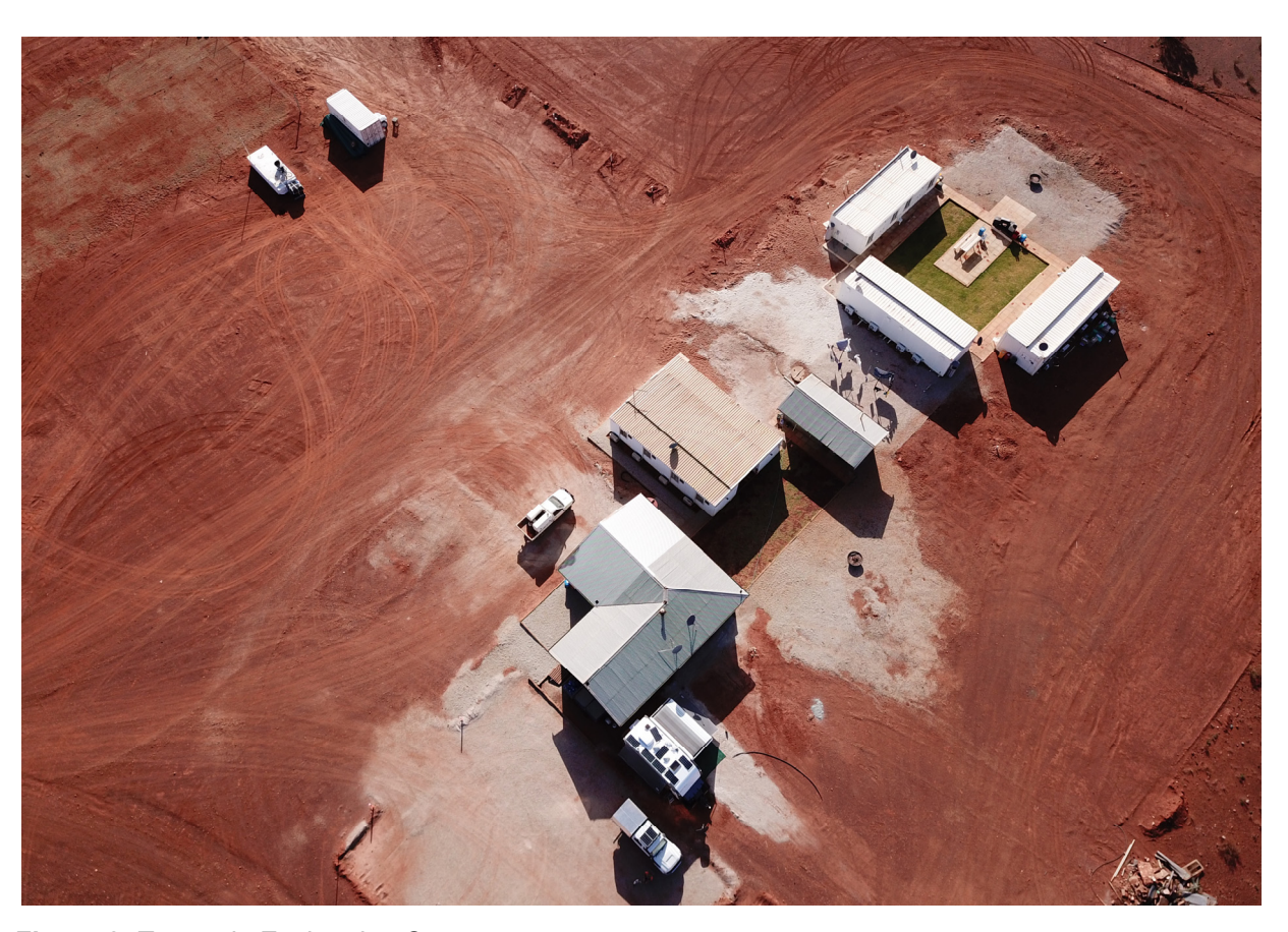
Figure 2: Tarmoola Exploration Camp