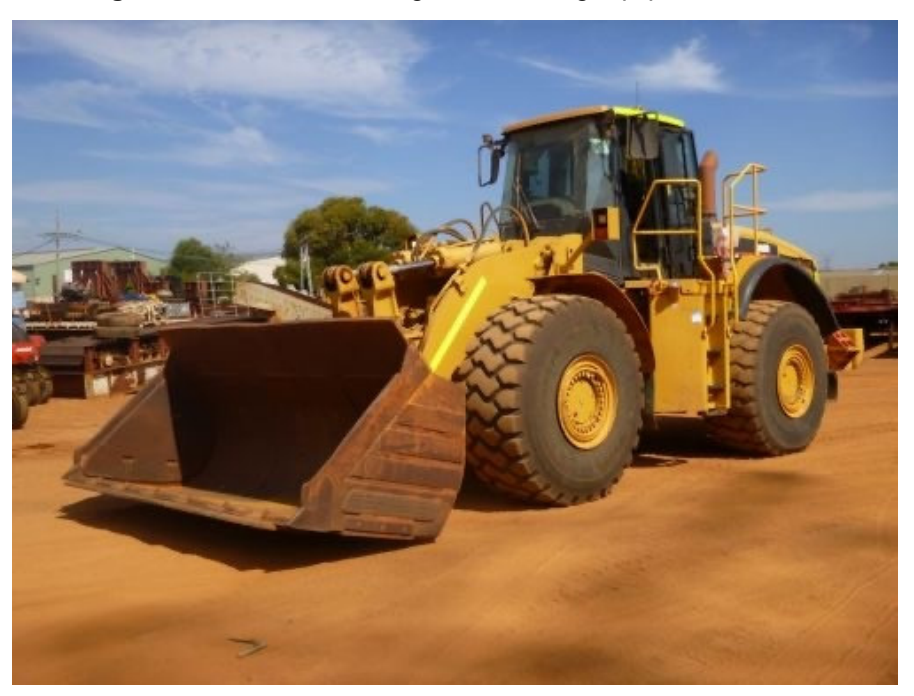
Figure 7: Carhill Contracting Earth moving equipment