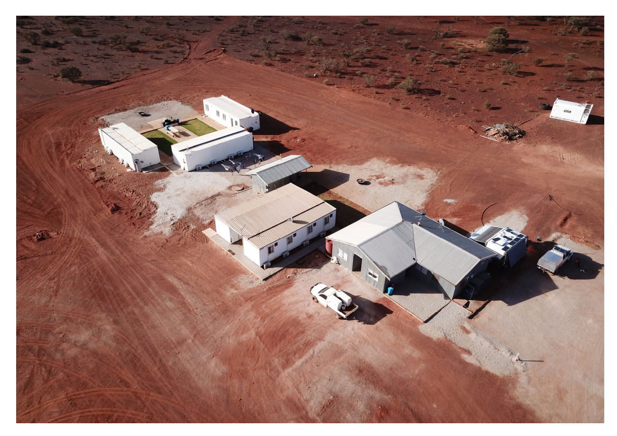
Figure 3: Tarmoola Exploration Camp (NW view)