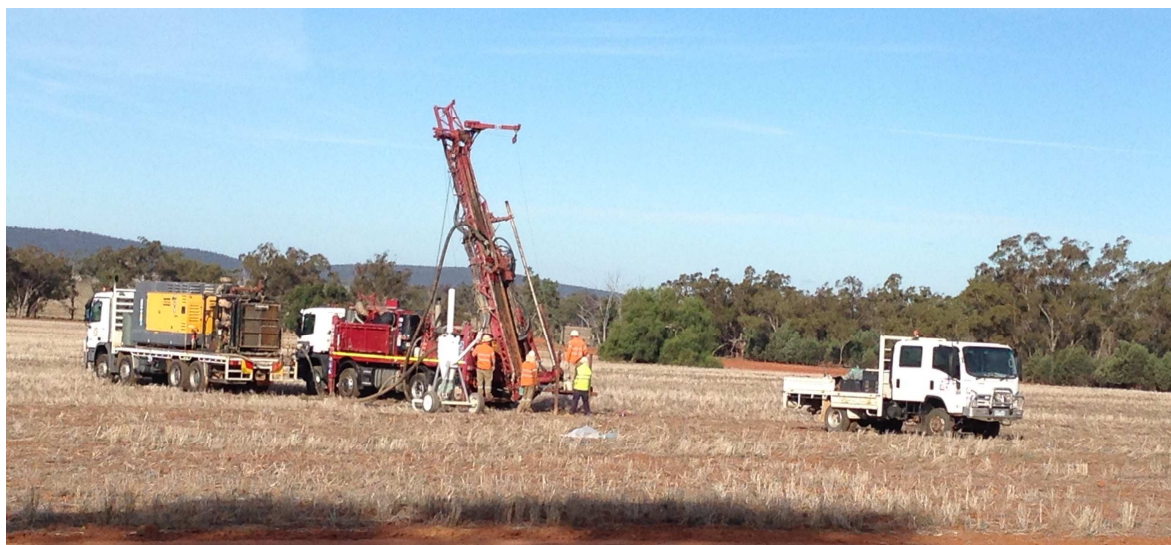
Figure 3: Thomson Resources first hole at Bygoo North.