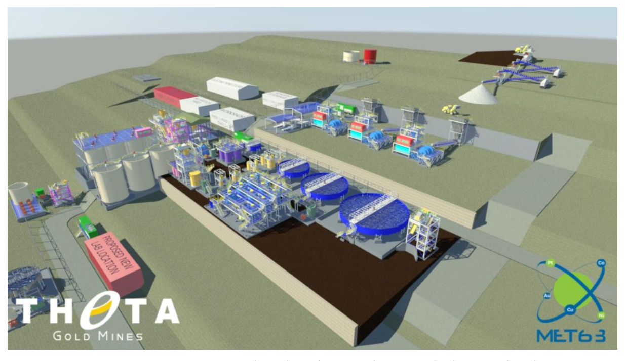
Figure 1: New TGME Plant Layout (ROM/Crush/Grind/Floatation/Oxidisation/CIL/Goldroom/Labs/Offices)

Theta Gold Mines Limited ("Theta Gold" or "Company") (ASX: TGM| OTC: TGMGF) is pleased to provide an update on the MR 83 gold processing plant. Theta appointed MET63, which specialises in the design and construction of advanced modular processing plants, to