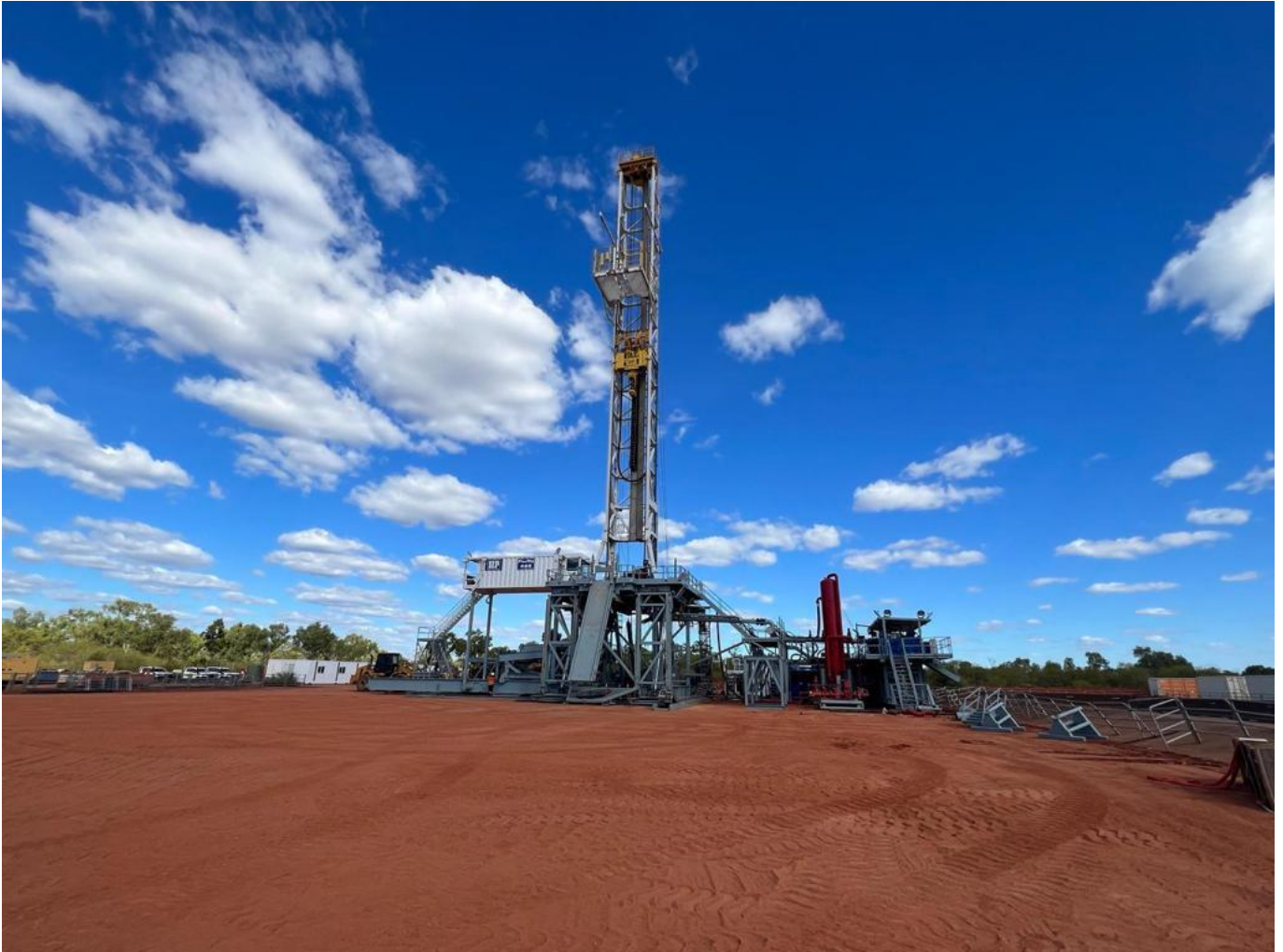
Figure 1: H&P's super-spec FlexRig® Flex 3 Rig mobilised to the Shenandoah South well location.