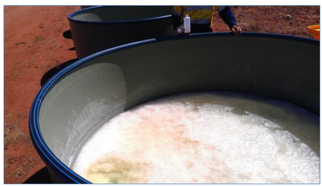
Figure 2. Recent picture at Karinga highlights the amount of salt and potassic-rich bittern remaining after months of evaporation in a single tank. The bittern is now removed so that it may be crystallised for processing of potassium magnesium sulfate and other compounds.