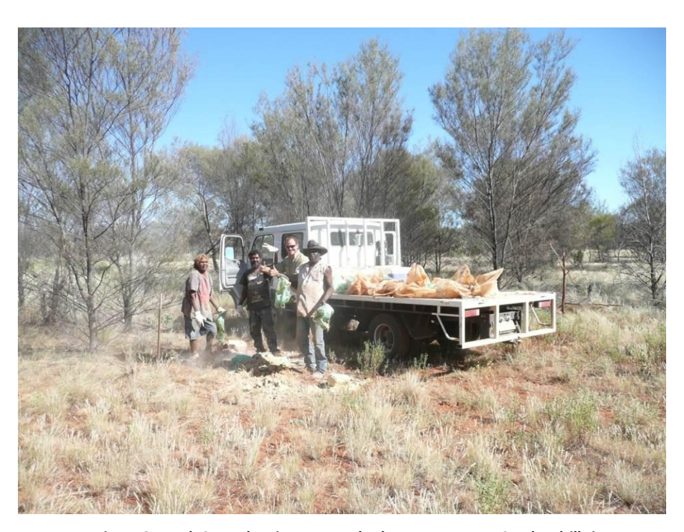
Figure 3. Work Crew cleaning up samples bags at a Barrow Creek 1 drill site.