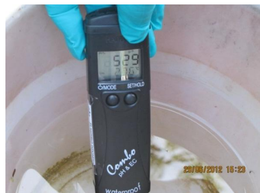
In situ measurements of pH, EC and temperature