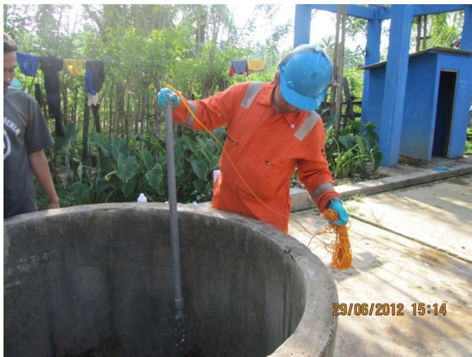
Well water sampling at Sukadami Village