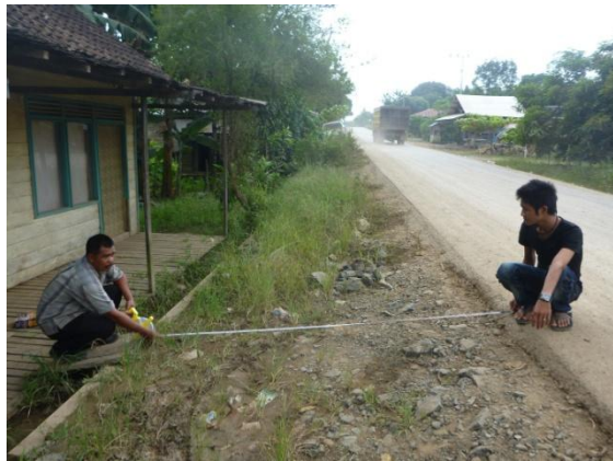
Measurement of frontage road on Rejosari Village