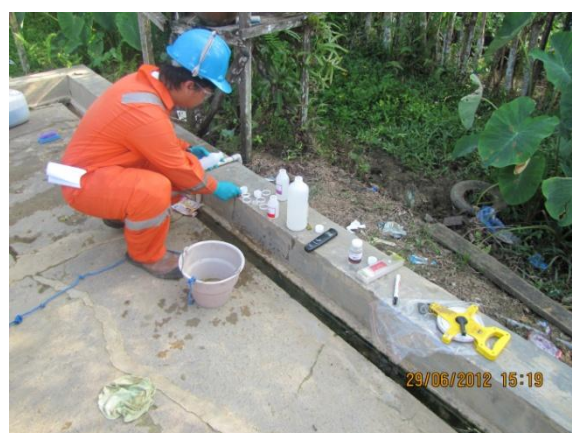
Samples being bottled to be sent to the laboratory