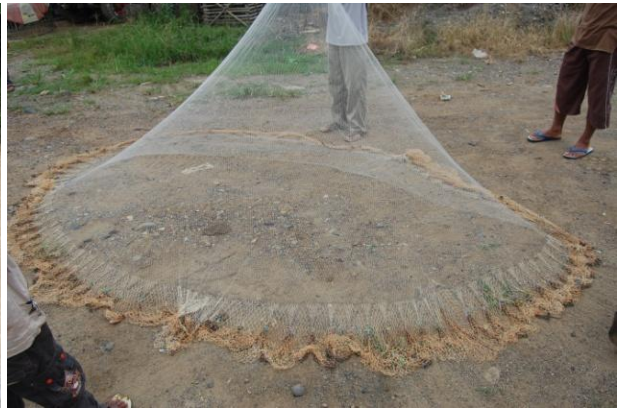
Fish net used for sample collection