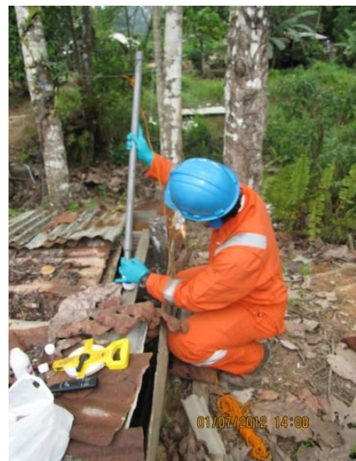
Well water sampling