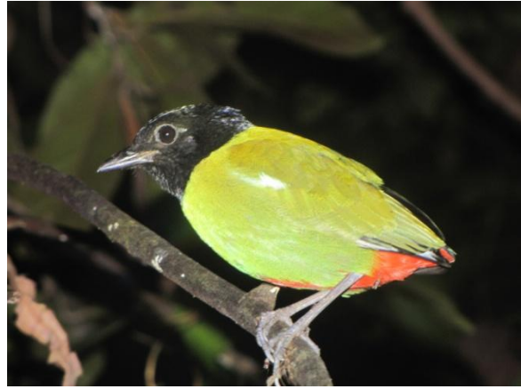
Hooded Pitta ( Pitta sordid )