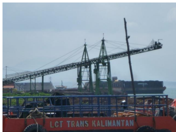
Barge loading facilities – End of survey