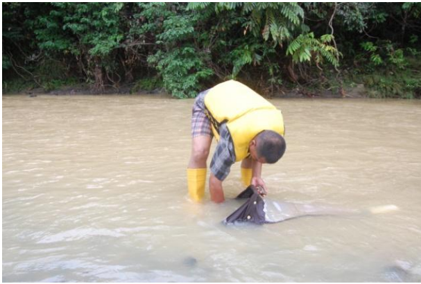
Microinvertebrate sampling using Suber-net at Ata River