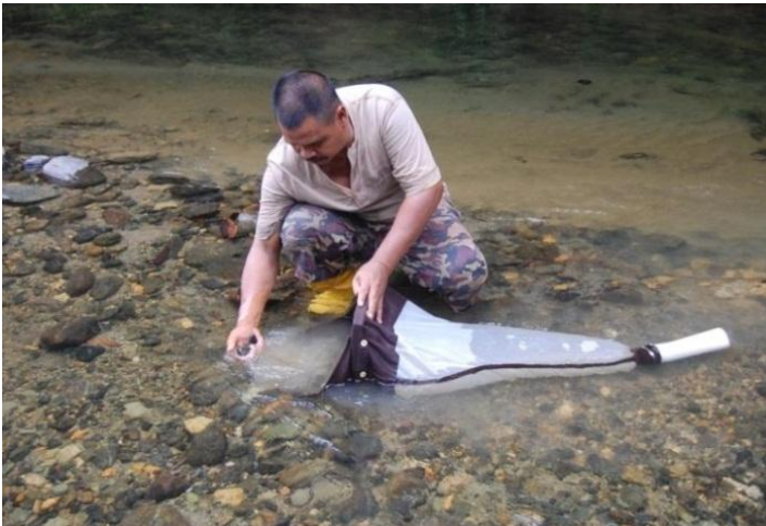
Microinvertebrate sampling using Suber-net at Tuyan River