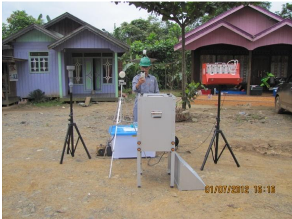
Ambient air sampling at Mantewe Village during the day