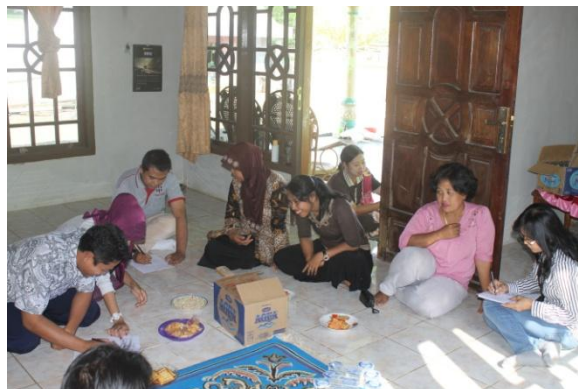
Interview for public health with local people at Rejosari Village