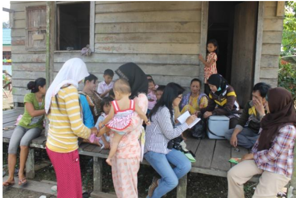
Interview for public health with local people at Mantewe Village