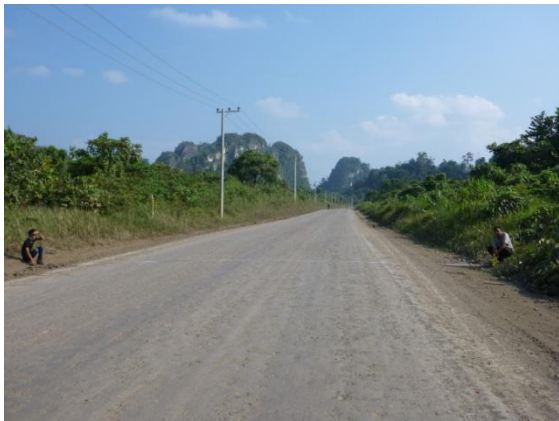
Measurement of road width