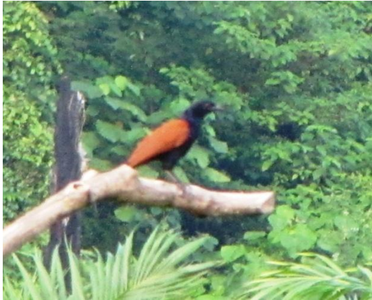
Greater Coucal ( Centropus sinensis )