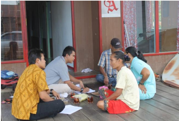
Interview with local people at Mantewe Village