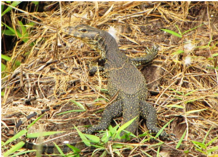
Water Monitor Lizard ( Varanus salvator )