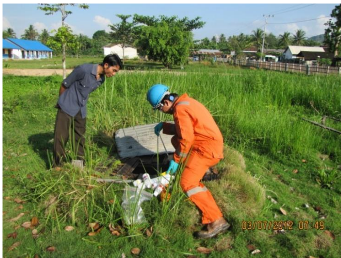
Well water sampling at Rojosari Village