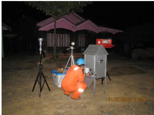
Ambient air sampling at Mantewe Village at night