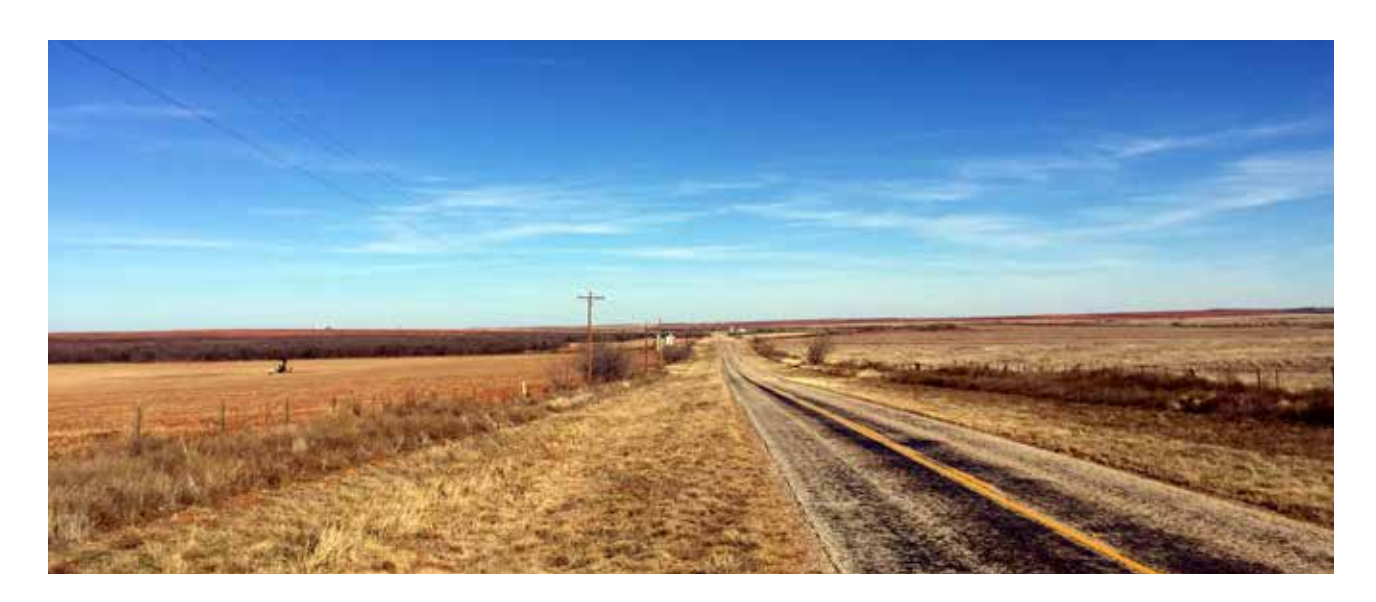
Landscape in the Capitola Oil Project, Texas