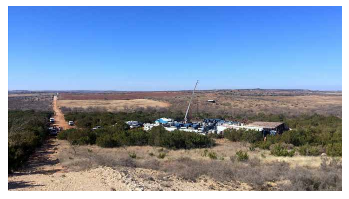
Fracture stimulation of the Mahaffey Bishop PU1