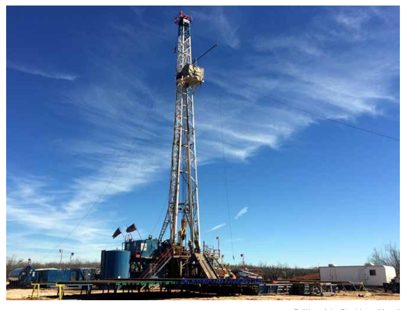
Drilling of the Shari Lynn #1 well