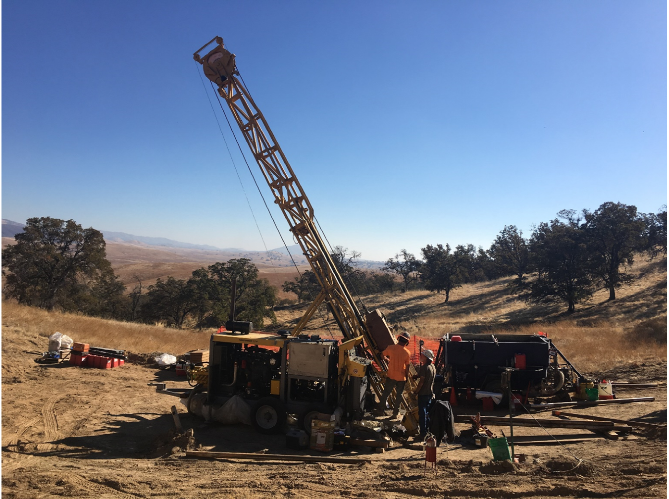
Figure 2: Diamond drill rig set up on site