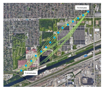
Reverse and forward trajectories