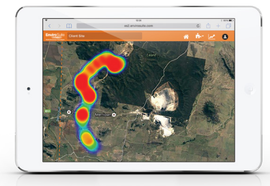
Complaint risk hotspots