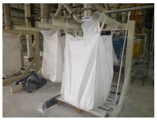
Bulk bags being filled with lithium carbonate to be sent to customers.