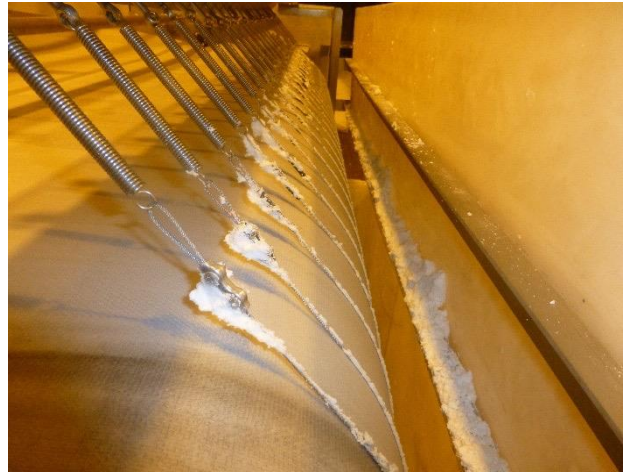
Lithium carbonate product on belt filter prior to the dryer.