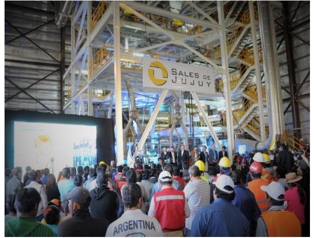
Micronising plant structure.

Since these events, the focus has been on commissioning the purification and drying/micronizing circuits, the final two circuits of the lithium carbonate plant. The final two circuits are now commissioned and the plant is operating in continuous mode with purification and micronizing circuits integrated with the primary lithium carbonate circuit. Following the production of initial material, product of the quantity and quality required for the final stage of customer qualification will now be produced in the coming weeks.