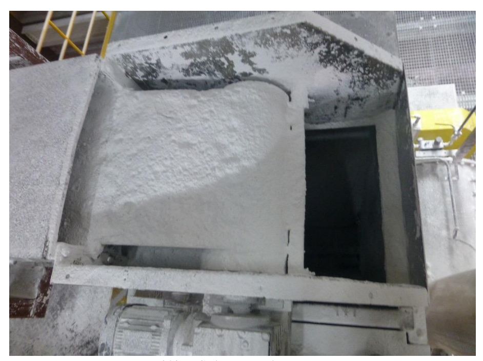
Lithium Carbonate Product

Orocobre Limited (ORE:ASX, ORL:TSX) ("Orocobre" or "the Company") is pleased to announce that the final circuits of the Olaroz lithium plant have been commissioned and the plant has now moved into commercial production ramp-up stage.