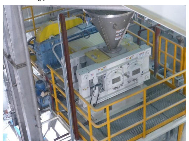
Micronising unit to produce 5 micron particle size.