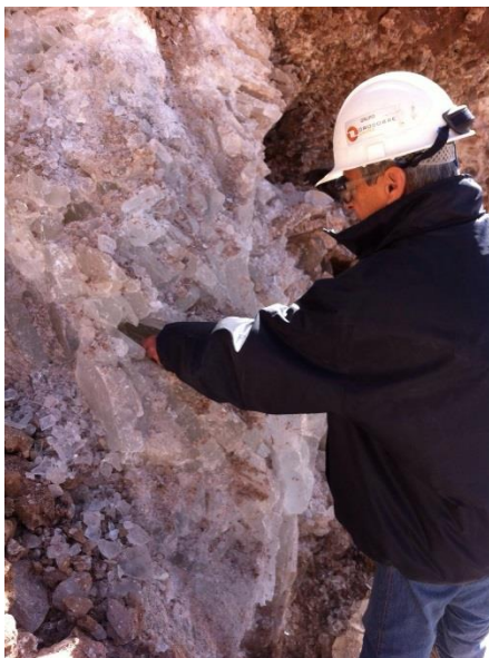
Mineralisation at Tincalayu mine

Borax Argentina has extensive operations and a fifty year production history producing borax chemicals, boric acid and boron minerals. The production currently comes from three principal mines at Tincalayu, Sijes and Porvenir with concentrators at the first two locations and a chemicals plant at Campo Quijano producing refined products. The borax circuit at the chemicals plant has been relocated to the Tincalayu mine where the mineral for borax production, tincal, is mined.