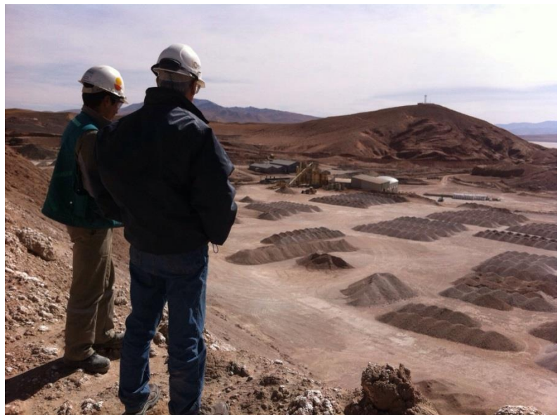
Tincalayu ore stockpiling