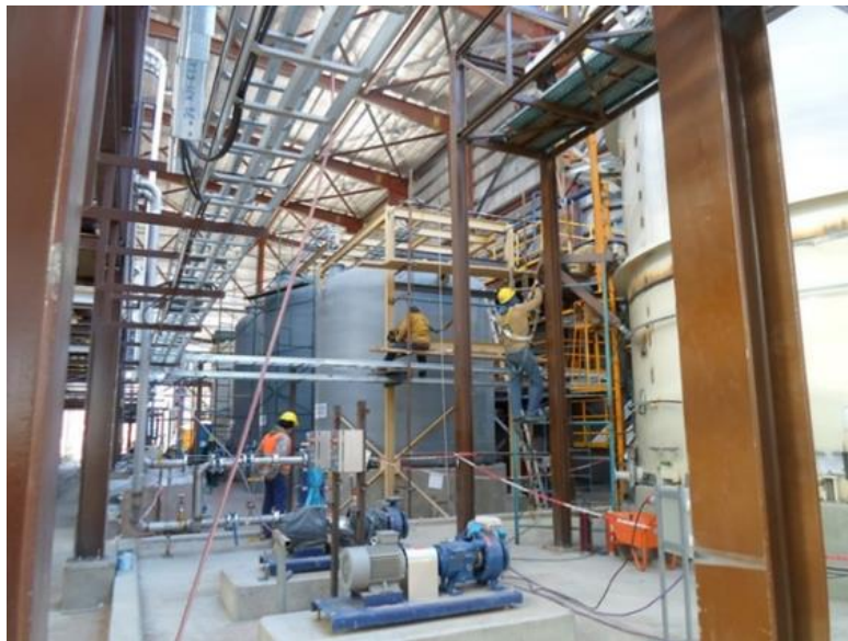
Construction of the lithium carbonate plant