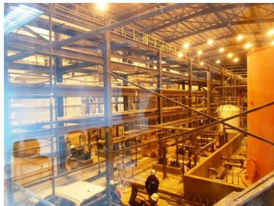
Inside the lithium carbonate building