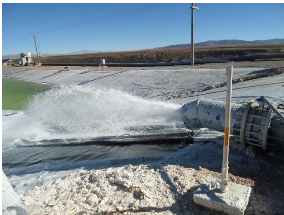
Pumping of brine to evaporation pond

After the construction and commissioning phases of the project are completed the operation will commence production ramp-up with shipments of battery grade lithium carbonate to customers expected to commence by the end of the year.