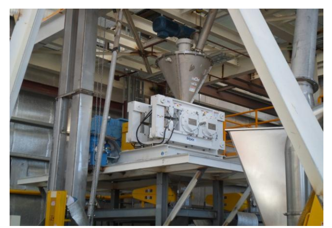
Inside the lithium carbonate plant