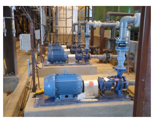
Transfer pumps in the lithium carbonate plant