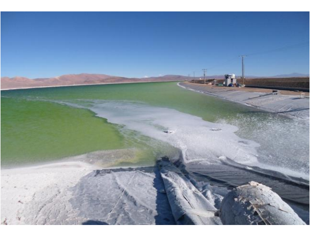
Brine transfer to an evaporation pond