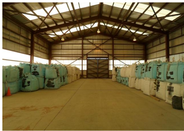
Reagent (soda ash) inventory