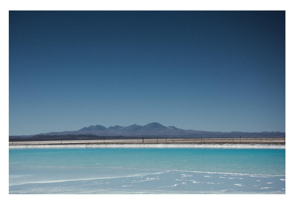
Brine ponds at Olaroz Lithium Facility

At the end of the quarter, brine inventory was approximately 40,300 tonnes of lithium carbonate equivalent.