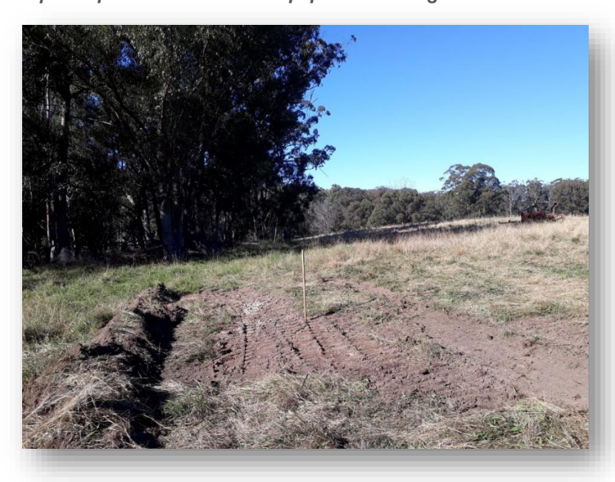
Figure 3: Pads being cleared for drilling