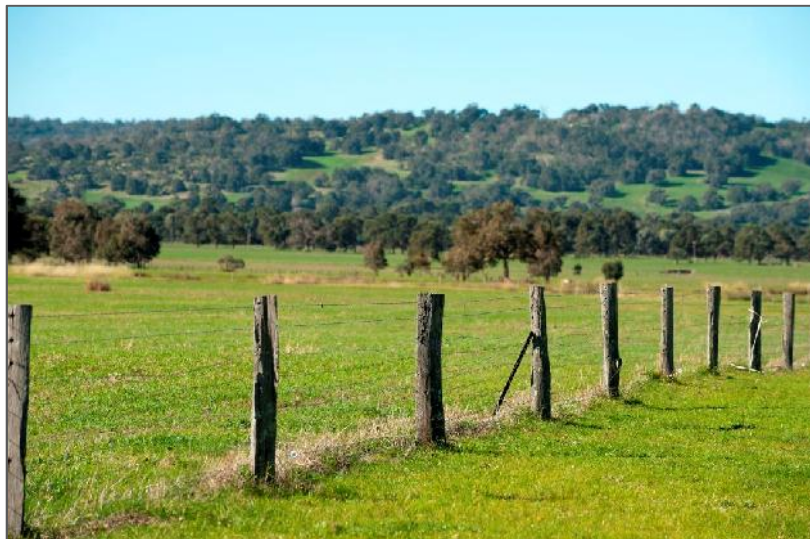
Nearby post-mining rehabilitated pasture