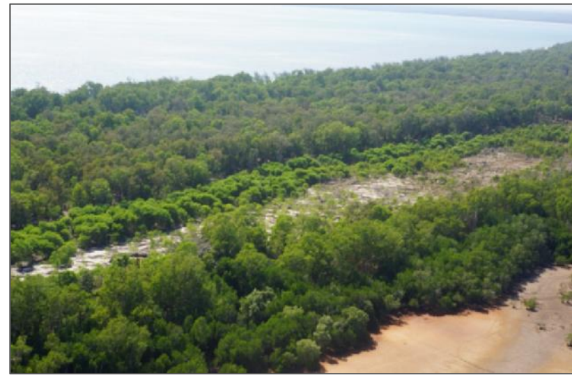
Rehabilitation progress at MZI's Tiwi Islands project