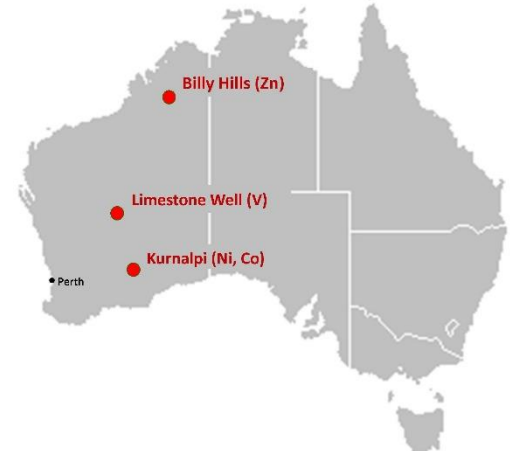
Figure 1: Project Locations

Monax plans to undertake reconnaissance aircore drilling to determine the vanadium potential of the magnetic units at Limestone Well as soon as possible.