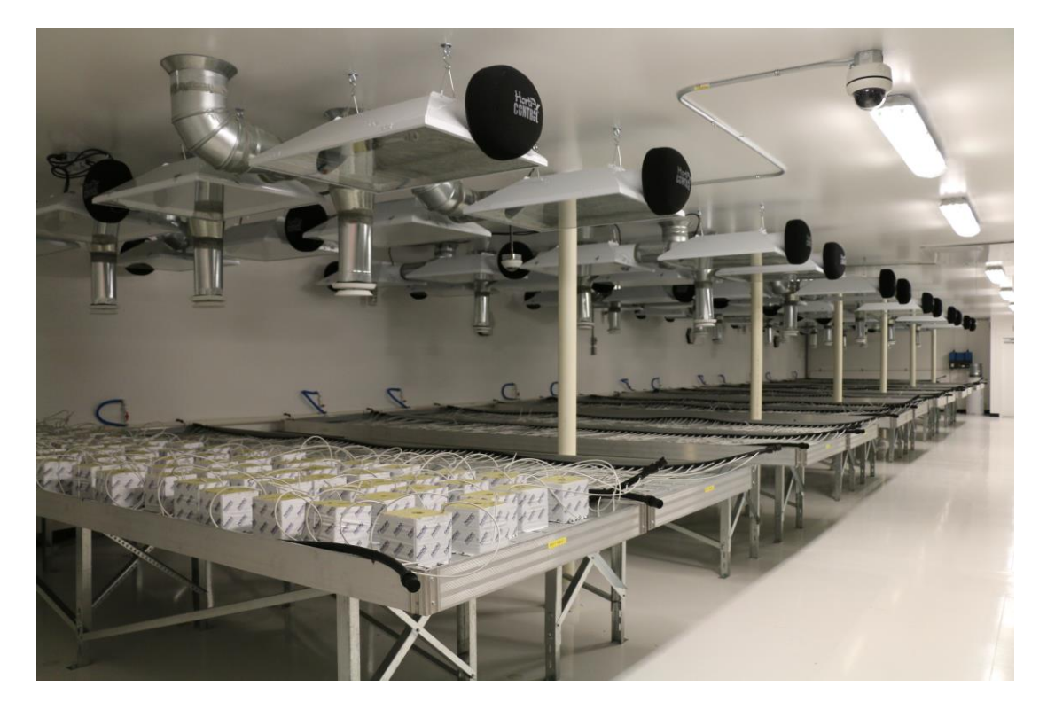
Figure 2: Duncan Facility Hydroponic Set-Up.