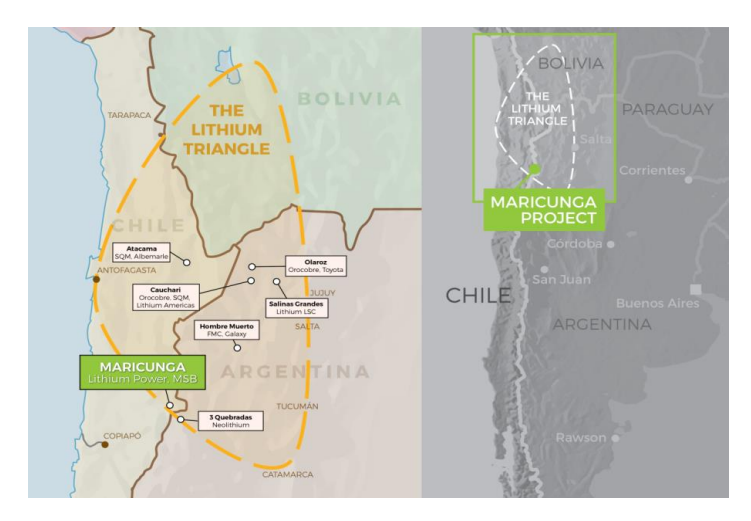
Figure 3: Maricunga project location in the Lithium Triangle in Chile

Lithium Power International E: info@lithiumpowerinternational.com Ph: +612 9276 1245 www.lithiumpowerinternational.com