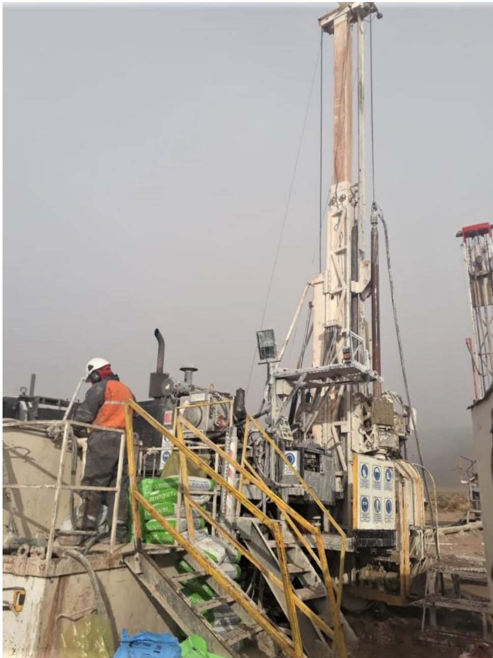
Figure 1: Foraco diamond drill rig at Lake's Cauchari brine project

Level 5, 126 Phillip St, Sydney, NSW 2000, Australia T: +61 2 9299 9690