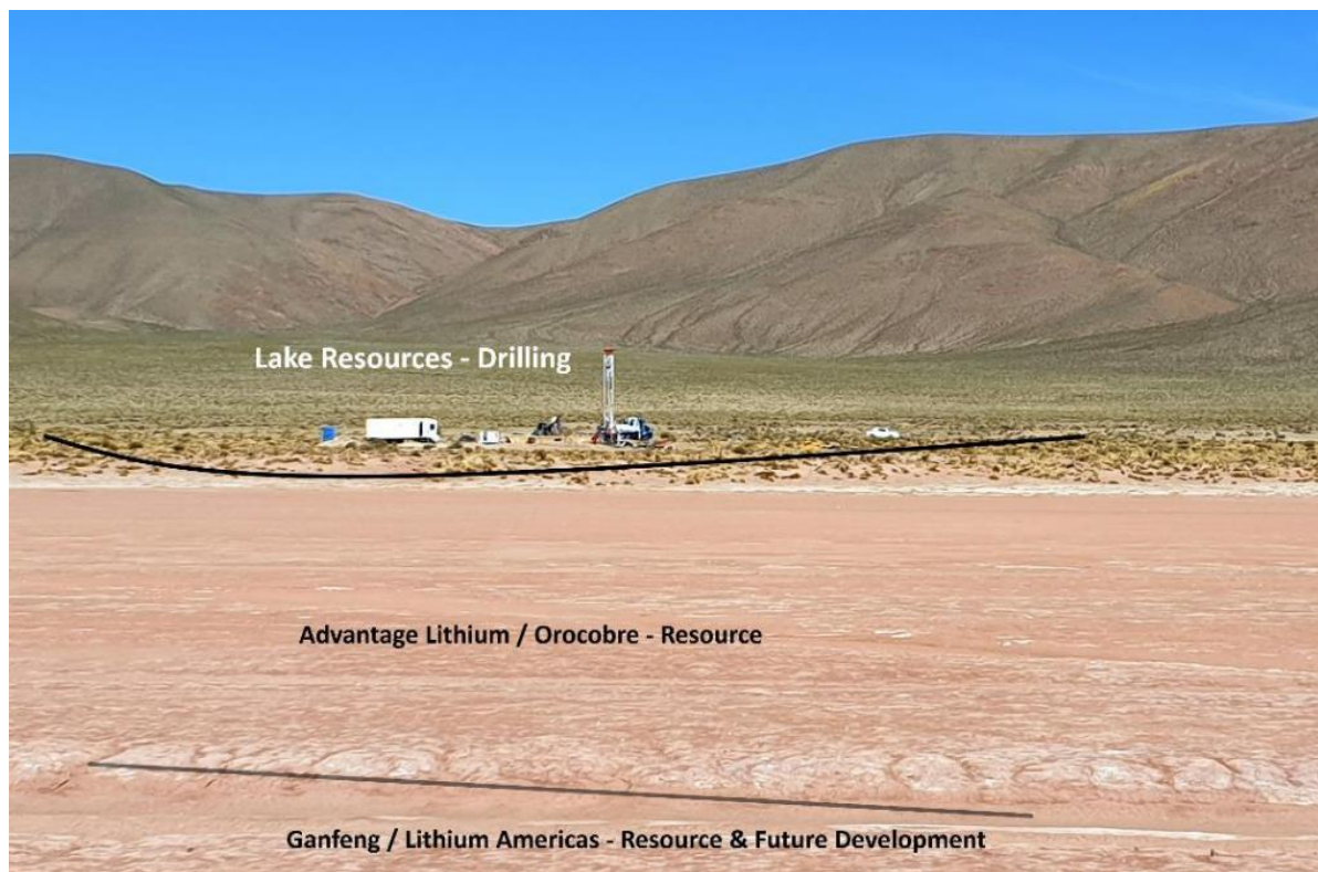
Figure 2: Location of LKE's drill operations at Cauchari in relation to Advantage Lithium/Orocobre & Gangfeng/Lithium Americas leases. (Note: The marked boundaries are indicative only. Please refer to the detailed map).